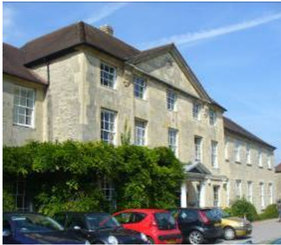
Headington Manor, built by Sir Banks Jenkinson in 1779

the map accompanying the enclosure award, although the present building was clearly remodelled later in the 19th century.