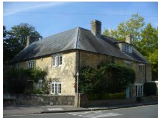
Corallian limestone with a lime render weather coating

lime mortar is important with this material to prevent damage through differential shrinkage and moisture retention, potentially leading to saturation and damage. It was used for buildings in mass (solid) wall construction, often with very thick walling that have a high thermal mass if well maintained. This is a heavy form of construction and its use determined the positioning of upper floor windows over lower to reduce loading on lintels and therefore has an influence on schemes of fenestration. It also increases the difficulty of building upwards and, therefore, contributes to the long, low form of buildings throughout the conservation area.