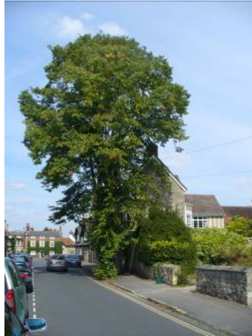
Mature lime trees at Old High Street

Within the conservation area the spaces where the public have a right of access (referred to as the public realm) include the parks, streets and alleys. The materials used to pave these areas, the planting and street furniture all make an important contribution to their character.