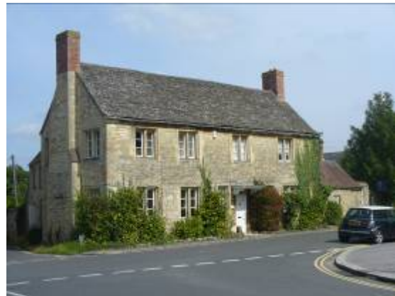
Mather's Farmhouse, dating from the 17 th century, forms a landmark at a focal point in the conservation area.

(No. 12). In the former this appears to be an original feature and, as a result, the front door to the building is located at the right hand extremity of the frontage with narrow windows lighting the area of the frontage in line with the chimney. At the White Hart, the main façade of the building was refronted in two sections suggesting it was divided into two properties at one time, with the central chimneystack rising between the two halves.