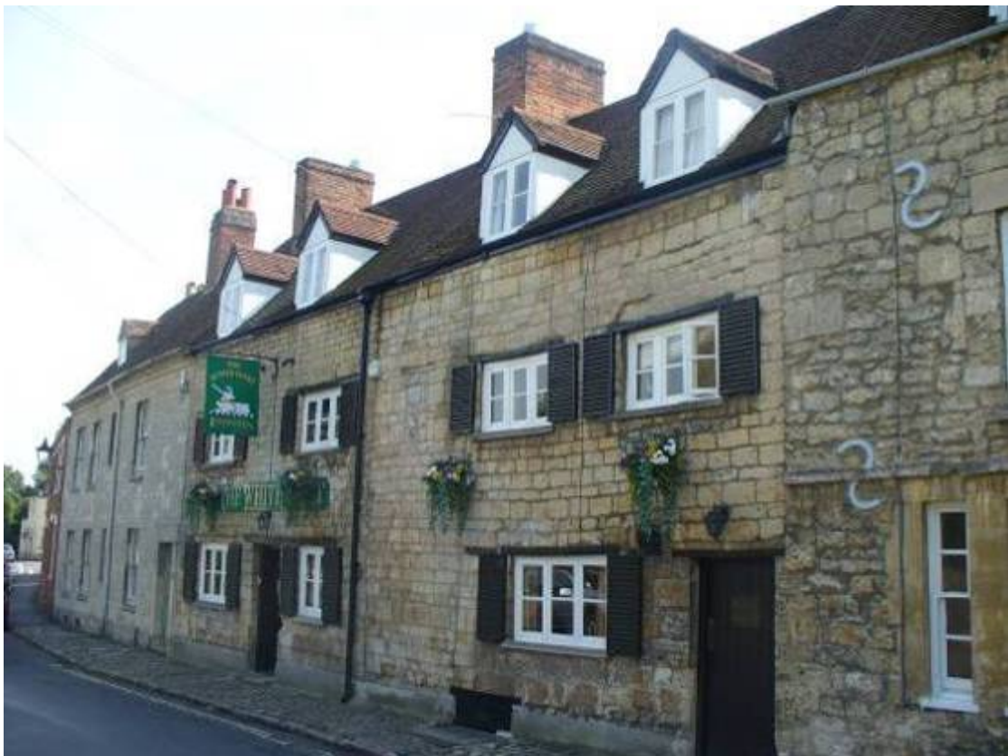
The White Hart Inn, St Andrew's Road

These new buildings and the 1605 map of Headington demonstrate the existence of both Larkin's Lane and St Andrew's Lane in the early 17 th century. The 1605 map reveals that a 'common well', located on the spring-line approximately 150 metres north of St Andrew's Road, was the destination of both routes, which must have been an important resource to the community and particularly to cottage dwellers who may not have had their own wells. The map also shows one of the college's properties located on St Andrew's Road, with a yard behind and a separate garden just to the south, forming the pattern still preserved in the frontage buildings at St Andrew's Road, with the gardens at the rear as preserved adjacent to No. 17 The Croft. A road named Oxford Way is shown following the modern alignment of Cuckoo Lane and running up to Old High Street. This was the main route from Oxford to Headington until the later 18 th century. A northerly branch of this road ran up to the western end of St