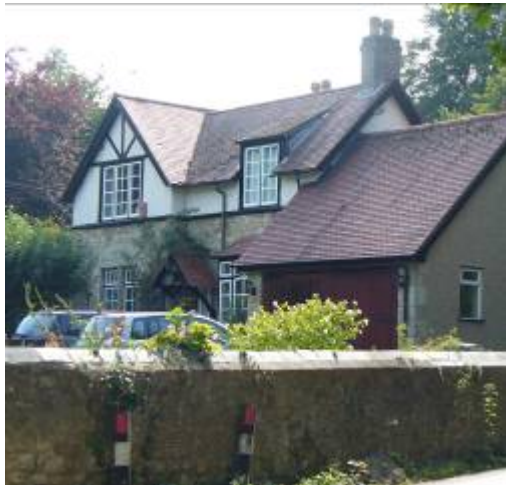
No. 6 The Croft

materials and features. Again the use of limestone helps to integrate these buildings with the older structures of the village.