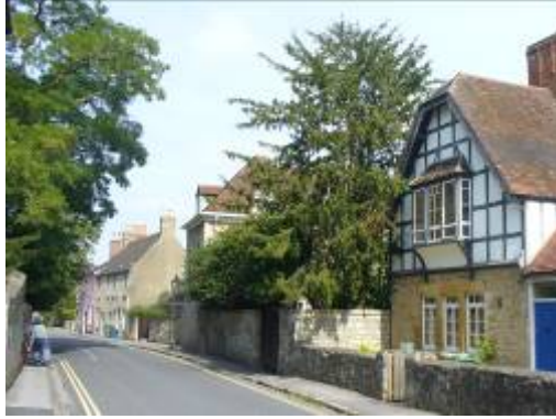
The British workman (right of frame), Old High Street

playground and pavilion. The house was converted for use as a public library in 1934 and the upper floor came to house the mother and baby clinic that had operated from the British Workman