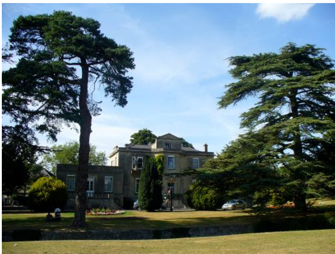
Bury Knowle House

Bury Knowle House, which stands at the centre of this landscape, is an Italianate