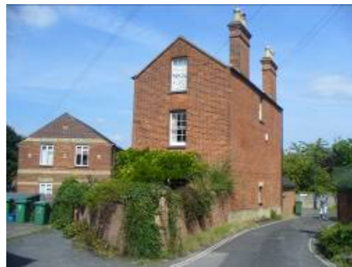
The Old Bakery at St Andrew's Lane

Several of the public and commercial buildings in the village have been mentioned in the description of the village's historical development. Most of these have now been converted to private houses. The two surviving public houses are perhaps the most visible of the commercial buildings. The White Hart has a history extending to the mid 17 th century, whilst the predecessor to the present Black Boy was recorded in the early 17 th century. The present building was constructed as a purpose-built public house in the early 20 th century in the 'improved public house' style. It may not satisfy all tastes, but does show attention to detail and antiquarianism in style, which is a hallmark of the attempt to re-brand public houses for more middle class markets. This involved use of 'Tudorbethan' and Arts and Crafts styles of architecture to recall the coaching inns of the early 17 th century. Other buildings with a commercial past include Mather's Farmhouse, which served as a bakery owned by the Berry family, until this business moved in to No. 1 St Andrew's Road, which has only recently lost its small shop window and bakery building to the rear. A second large bakery building was located at the northern end of St Andrew's Lane and has a stark appearance as a tall brick building with few windows overlooking the road and two prominent chimneystacks rising from its roadside frontage.