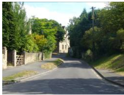
View south along St Andrew's Road between Green verges

Old High Street and The Croft, St Andrew's Road and Osler Road, and the small space between the Laurel Farm Close development and The Croft. These small green spaces contribute to the informality of development that is part of the rural character of the village, as well as forming part of the greening of the streetscene. The grass banks and verges on several routes in the conservation area, including Osler Road, Barton Lane and Dunstan Road make a similar contribution and help to maintain the 'ring of green space' that separates the village core from the surrounding suburban development.