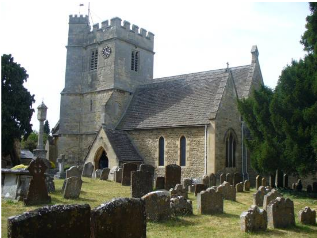
St Andrew's Church

The manor of Headington remained in the ownership of the king throughout the 11 th century and was the second of the king's properties recorded in the Domesday Survey of Oxfordshire in 1086. This reflected the importance of the estate which provided the king with an annual income of £60.