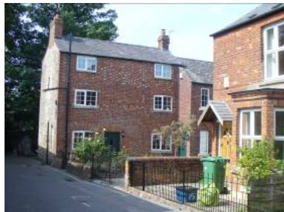
Houses of brick and stone at The Croft, built in the mid and later 19 th century

In 1850 Quarry had grown to a size that justified its independence from Old Headington through creation of a separate ecclesiastical parish. During the 1860s sale of farmland south of London Road enabled the New Headington suburb to develop between the two older settlements. The rate of development escalated rapidly after the sale of Highfield Farm, although in the 1870s Headington was still described as an agricultural parish growing wheat and barley. The economic fortunes of the parish had clearly recovered by the mid-century and in 1864 major restorations were undertaken to St Andrew's Church, including a westward extension of the nave by the locally significant architect J. C. Buckler. A north aisle was added to provide even more accommodation in 1881 along with the north porch and vestry.