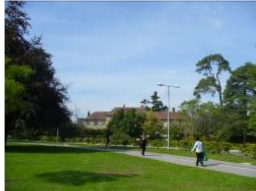
View to Headington Manor at The John Radcliffe Hospital

These views serve to highlight the importance of these buildings and often include supporting features including trees, other planting and sympathetic boundary features that are part of a designed view.