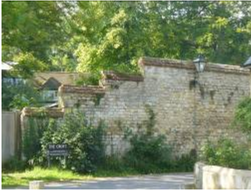
Stone boundary walls at The Croft

neighbours. Now they create intimate, enclosed areas with a tranquil ambience.