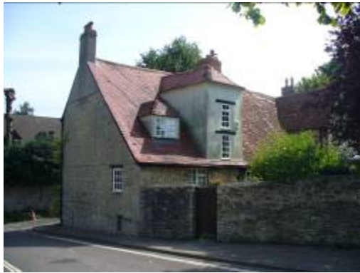
The rear of Church Hill Farm showing the stair tower and 'cat-slide' roof

are seen at The Court, The Croft and Church Hill Farm, St Andrew's Lane, whilst the stair-tower at No. 14 St Andrew's road was apparently rebuilt in brick in the 19th century. Church Hill Farm also provides a good example of the cat-slide roof added at the rear to cover two single storey extensions either side of the stair-tower. Where space has allowed, or where the street pattern facilitates it, these early buildings have an east - west axis that makes efficient use of available daylight. Some of these properties were subdivided using the central passage as a natural point of division, as recorded at No. 16 St Andrew's Road.