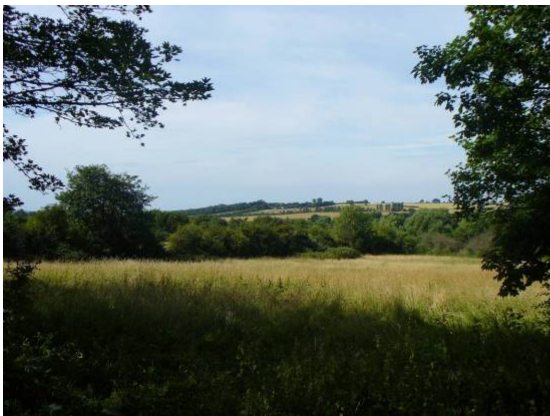
View north west from Stoke Place bridleway

Stoke Place is continued within this area as an attractive public bridleway running northwards from the Dunstan Road Character Area lined by trees that help green it. The bridleway runs up to the ring road between land owned by Ruskin College and other privately owned fields. To the west, iron railings with an unusual gate form a distinctive boundary to Ruskin