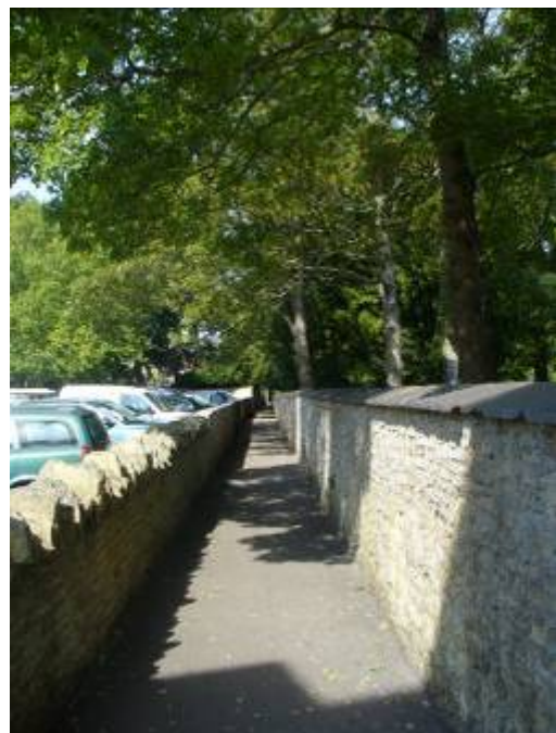
Coffin Walk next to Bury Knowle Park

Headington on Corpus Christi College's map of its landholding produced in 1605. Between Osler Road and Old High Street it runs along a sunken course, with banks to either side, which are topped by garden fences and shrub growth. Stephen Road provides a gap in the enclosure of the southern side of this alley. A third narrow alleyway runs along the western edge of Bury Knowle Park. It is named Coffin Walk, recording the creation of this route as an alternative to the processional route for funeral parties from Quarry to St Andrew's Church across Bury Knowle Park before the building of Quarry Church.