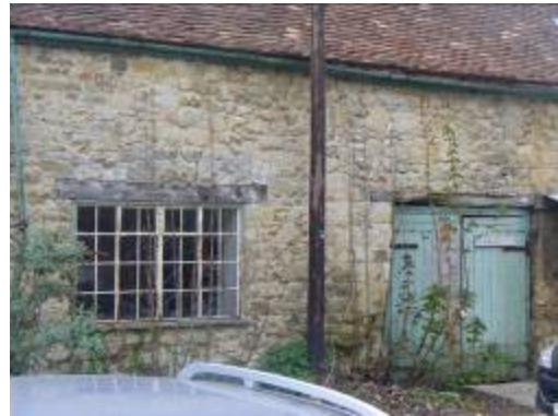
Details of the barn doors and windows at Bury Knowle