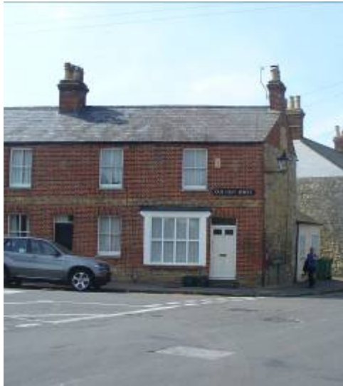
The Old Post Office at No. 94 Old High Street

box to the sidewall, despite its conversion to residential use. This was Headington's first post-office and continued in use as a grocer's shop first under the name of Rudd's and subsequently under several owners. It remained as a shop until the 1970s. Just a few doors to the south, the small Whitewashed cottage at No. 86 Old High Street was a butcher's shop owned by another member of the Berry family. It has been restored as a dwelling in recent years with the loss of the shop window.