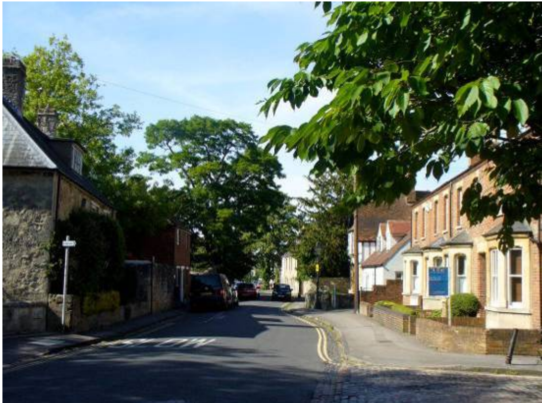
View north at Old High Street

This area contains the central streets of the historic village, with long and gently sinuous paths and a strong sense of enclosure provided by closely spaced or informally terraced buildings built at the back of pavement, behind small front gardens or with high garden walls of local limestone to the road. This area contains the focus of the seventeenth and eighteenth century houses, cottages, inns and farmsteads as well as the medieval core of the village around the parish church of St Andrew. It has a quiet, residential character, with only four non-residential buildings (two churches and two public houses), although it preserves the evidence of shops and businesses that reflects the historic village as an independent community. Buildings are generally low in scale, only occasionally