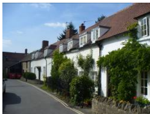
View west along cottage frontage at The Croft