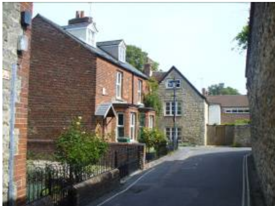
Groups of buildings cluster around narrow lanes at The Croft

metres from the Old High Street entrance, runs through to Osler Road with the grounds of Headington House and Sandy Lodge on its south side. On its north side there is a scatter of development including Victorian semi-detached cottages, older houses of 17 th , 18 th and early 19 th century construction, as well as the small converted chapel of Croft Hall. The side boundaries of properties in the Laurel Farm Close development form a significant portion of the northern side of this path. A side spur also provides access to Osler Road at The Court. West of this point a more continuous frontage of houses and cottages addresses the footpath on its north side. The second, northerly arm running off the main north-south route has a continuous frontage of small cottages and other buildings on its north side but is more open to the south, with some open plots running through to the southerly arm. At its west end this route narrows to an unusual unmetalled green footpath that runs in front of No. 8 The Croft and curves around to the south to join the southerly arm next to Croft Hall.