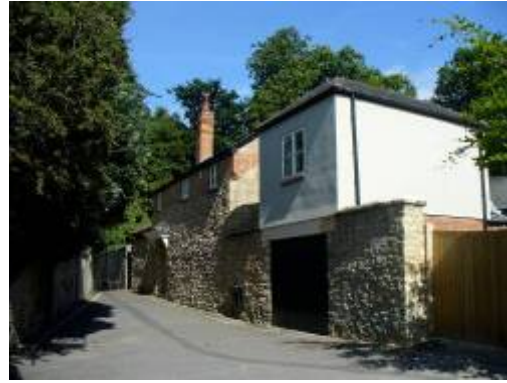
The Coach House, The Croft

Houses throughout the area are of a consistent low scale, rarely of more than two stories, whilst the cottages at Nos. 9, 11 and 11a The Croft are a group of single storey cottages with additional attic rooms lit by dormer windows. The character of individual materials throughout this area, such as the distinctive colouring and texture of both the locally produced handmade brick of the early 19 th century and the later 19 th century wire-cut bricks is immediately appreciated due to their proximity to the pedestrian.