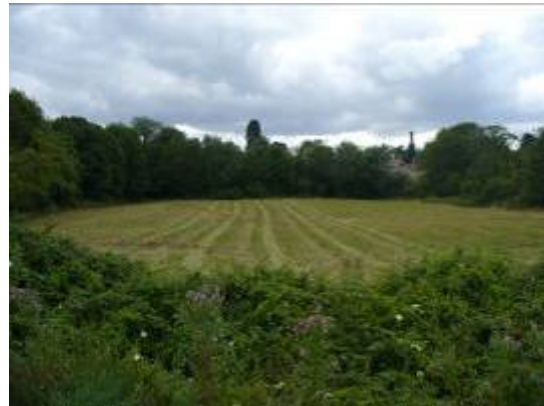
Trees line the edges of small fields to the north of Ruskin Hall

apple varieties. The derelict garden plot in The Croft also contains several veteran apple trees that may represent historic local varieties.