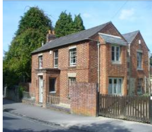
No. 35 St Andrew's Road, local red brick laid in Flemish bond

Brick: In the early 19th century the use of brick to provide, at least, the most visible facades of buildings reflects the adoption of this material as a high status material. These buildings are not uniform however and provide different styles of construction that reflect the status and prestige of their builders. The neighbouring properties at Nos. 1 and 3 St Andrew's Road have a main façade of brick, with smooth surfaced Bath stone dressings to windows jambs, lintels, quoins and a stringcourse over the ground floor. No. 35 St Andrew's Road has a brick stringcourse over the ground floor with brick sills to windows and rusticated stone lintels. No. 16 The Croft is a humbler building, originally two cottages, with significantly less architectural decoration, although the use of gauged brickwork for flattened arches to the window and door openings provides a sense of pride in construction. The terrace of small cottages at Nos. 2 - 5 The Croft provide the lowest status properties in this group and were presumably workers houses for one of the villa estates. Although they are simple buildings, they still have carefully crafted gauged-brick arches to the door and window openings.