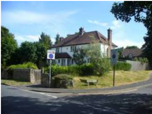
Orchard End, Dunstan Road

The process of villa or mansion building by wealthy Oxford merchants is represented on Dunstan Road by Ruskin Hall (originally The Rookery). Like the village's other mansions, this property preserves the genteel landscape of villa or mansion with associated coach house, walled kitchen garden and pleasure grounds with exotic tree planting, all within the enclosure of a high stone wall. Ruskin Hall is unusual, however, in having been taken up for the use of Ruskin College as a higher education establishment in the mid 20 th century. The college is currently in process of moving from its premises in central Oxford, to the Old Headington campus and expects this to be completed by September 2012. The grounds have attractive views northwards over the small fields within the conservation area to the rolling arable countryside around Elsfield in South Oxfordshire.