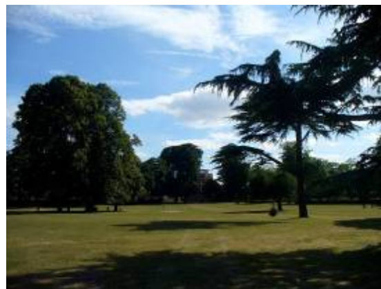
Specimen trees in parkland at Bury Knowle Park

Modern additions to the public parkland include references to Headington's literary heritage and, particularly to C.S. Lewis' children's stories. These include the Storybook Tree, and the surrounding benches, which depict animals that feature in the Chronicles of Narnia, as well as the 'Peace Sculpture' of 12 decorated slabs set in the grass, each provided by one of Headington's schools. The large children's playground, enclosed by a low beech hedge, provides another resource for families with small children in the park.