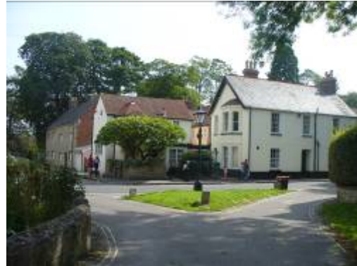
A small green space between Old High Street and The Croft

two of these landscapes. Along with the parkland and small fields, these larger gardens provide a buffer of open space between the village and surrounding urban development that helps to preserve its rural character.