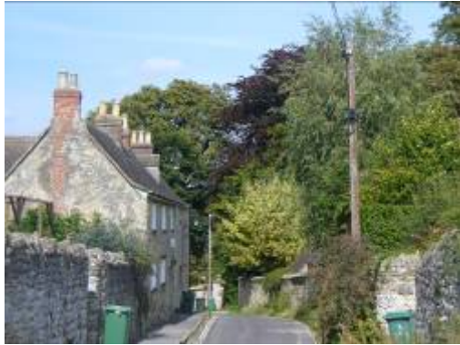
Trees in the grounds of The Grange provide an attractive backdrop to views from Larkins Lane

including Ruskin Hall and The Grange, as well as the John Radcliffe Hospital have a similar effect elsewhere.