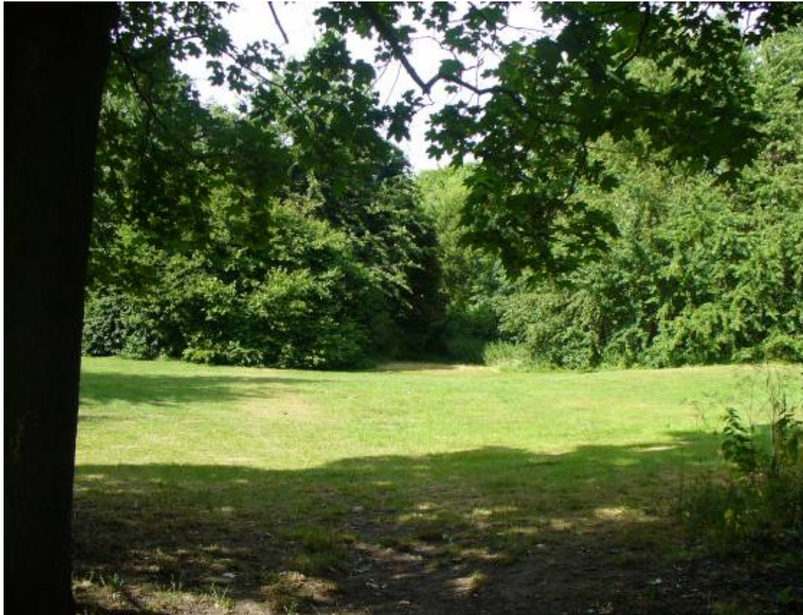
Green open spaces at Dunstan with opportunities for wildlife

and movement of wildlife into the centre of the village.