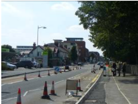
London Road south of the conservation area

Along the southern edge of Bury Knowle Park the conservation area adjoins and includes part of the busy route of London Road. This is an important traffic route into the city from the east, as well as serving the residential areas and business of Headington. Facing the conservation area London Road has a very mixed frontage, which includes historic buildings of local significance such as St Andrew's Primary School and the Victorian-era Post Office, as well as small high street businesses, private houses and a small supermarket. The long, straight route of London Road provides dramatic views along the front of the park's boundary walls.