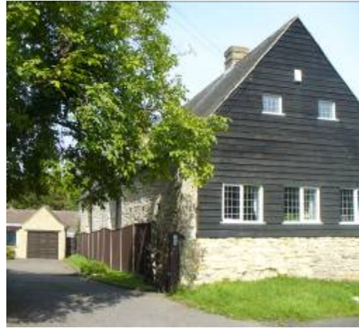
The Barn at Barton Lane stands out as a building formerly used for agriculture

In addition to the houses and cottages of the rural community, the conservation area contains several examples of the agricultural buildings that served its farms and smallholdings. Perhaps the best example of these is the 18 th century barn at Barton Lane, now converted into housing. Others include the barn to the west of Bury Knowle House, a building adjacent to No. 20 St Andrew's Road (Laurel Farm House) and another small barn in the grounds of the John Radcliffe Hospital. As noted above the White Hart Inn also retains a small barn of 18 th century construction facing onto The Croft, which retains many original features. These buildings take a variety of forms but their agricultural purpose is normally readily understood by the onlooker as a result of original features such as their barn or stable doors, distinctive window forms and absence of lighting to upper floors or attics. As such, they make an important contribution to the rural character of the conservation area.