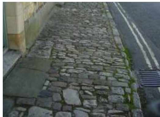
Area of listed Paving at St Andrew's Road

Paving: When many of the houses in the conservation area were built the surrounding roads would have had a basic surface of beaten earth as preserved in the small footpath near No. 8 The Croft. Areas of historic paving are decidedly unusual in rural contexts and, as such, the 18th century limestone cobble pavement outside the White Hart Inn is a particularly rare survival and makes a significant contribution to the setting of the adjacent group of listed buildings. As such it has been given listed building status in its own right. The pavement has been re-laid in the recent past, somewhat inexpertly, but still makes an important contribution to the character of this part of the conservation area.