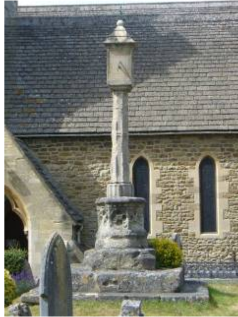
The village's medieval cross in the St Andrew's churchyard

The mid-12 th century village of Headington, next to its stone church, would have stood at the centre of an extensive agricultural landscape of open arable fields lying to the east, south and west. A smaller amount of pasture land was located directly to the north of the village and must have been a closely guarded resource, used for both livestock and draught animals (see the Green Fields Character Area, below). A main street along the line of St Andrew's Road would have lain just above the spring line. The boundaries of a series of tenements running along the south side of St Andrew's Road are suggested by the plots of the modern land holdings, which run back from the street frontage around long gardens that end at a lane (The Croft) that probably provided access to small agricultural buildings on their southern boundaries. Beyond this lane the plots continued as long narrow gardens that ended at the edge of the open field. Larger properties were clustered around the main street as discrete farm units.