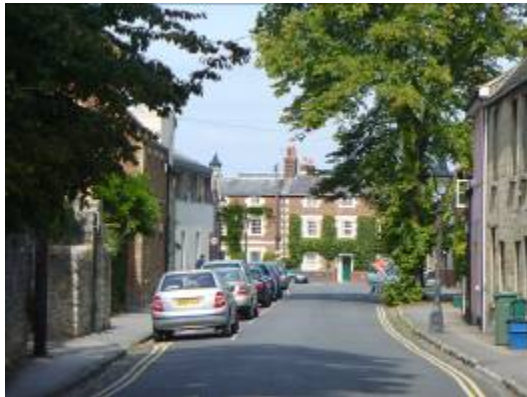
A channelled view along Old High Street

View type A: Views channelled along streets: Throughout much of the conservation area, views are enclosed within streets by the surrounding buildings and trees to focus attention along the routes of roads. These views emphasise the importance of the street pattern to the structure of spaces within the village and to the historic development of the settlement along it. The gentle rhythm of divisions between buildings and properties provides a key element to these views. The views north and south along Old High Street in particular benefit from the pinch-points, where the road is narrowed or where large trees arch over the road, often providing a small focal point in the distance. The trees and greenery of the village gardens make an important contribution to the character and aesthetic quality of these views