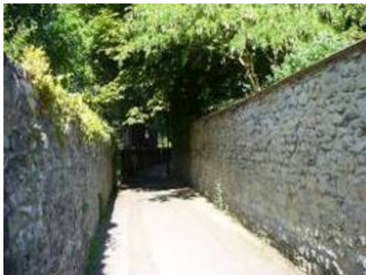
High walls of limestone rubble are a distinctive feature in the conservation area

The bed-rock beneath the village is made up of Lower Corallian beds of sands and grits interspersed with layers of limestone rubble, which provides a long-lived building material as roughly coursed walling, for which it has been used throughout the village. However, it is not suitable for finer masonry. Quarries to the south east of the village provide access to the Upper Corallian series, which include the Headington Hardstone, used for building plinths and kerbs, as well as the softer freestone. The latter was prized for more intricate work and fine ashlar until the 18 th century, by which time its poor weathering qualities had become all too evident throughout Oxford's churches and college buildings. Some examples of both stones are found within the village, although freestone from Barrington and Taynton, near Burford, are also found. Lime for building mortar was reportedly brought from Witney.