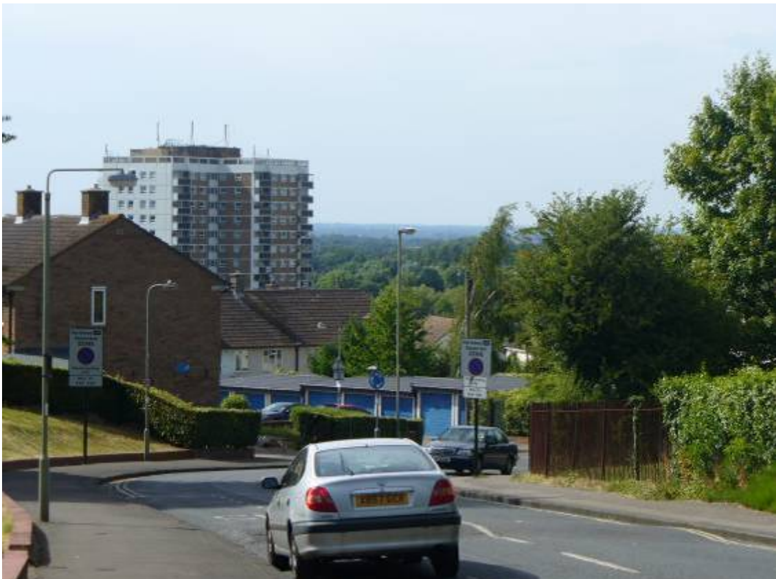
View west out of the conservation area from Dustan Road looking over suburban housing to the Cherwell and Thames Valleys

The limestone of Headington Hill gave rise to well drained soils that would have been easily cultivated and much of this area was arable land in the open fields of Headington until enclosure at the