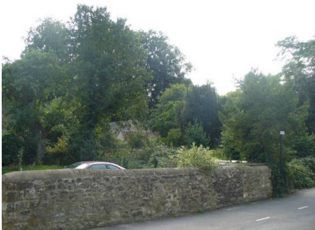
View across gardens at The Croft towards Headington House