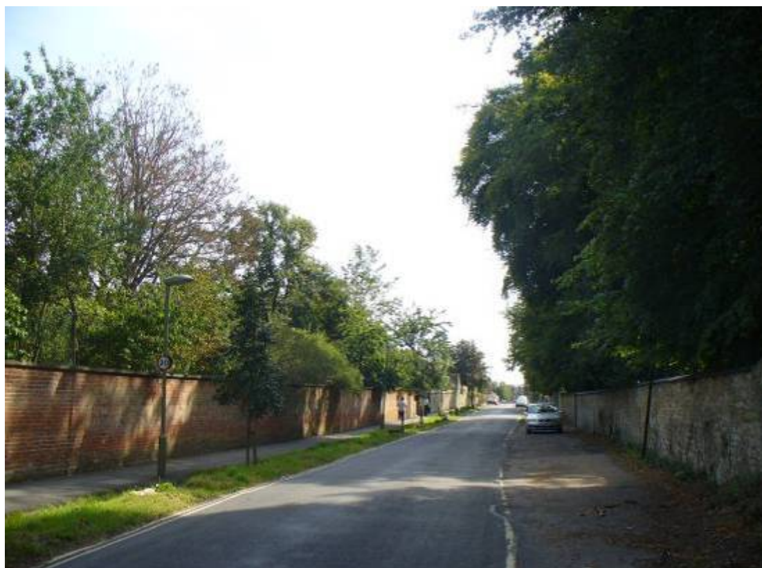
View south along Osler Road

As a result of their inclusion in the grounds of the John Radcliffe Hospital, the buildings and formal landscape of Headington Manor are accessible to the public. Unfortunately, the construction of