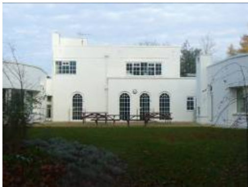
William Osler House, The John Radcliffe Hospital

Of the early 20 th century houses in the conservation area, a few stand out as particularly interesting. Between 1912 and 1925 The Hermitage (No. 69 Old High Street) was developed from a part of the former maltings into an attractive Georgian style house by a former keeper of Fine Art at the Ashmolean Museum. The conversion is convincing and anyone would be forgiven for thinking the building to be at least a hundred years earlier in origin than it actually is. William Osler House, recently substantially extended, is quite different and provides the village's only example of the white rendered modernist style. It was designed by Stanley Hamp in 1931 for the administrator of the developing Radcliffe Infirmary premises at Headington. It is now used as teaching facilities for the hospital.