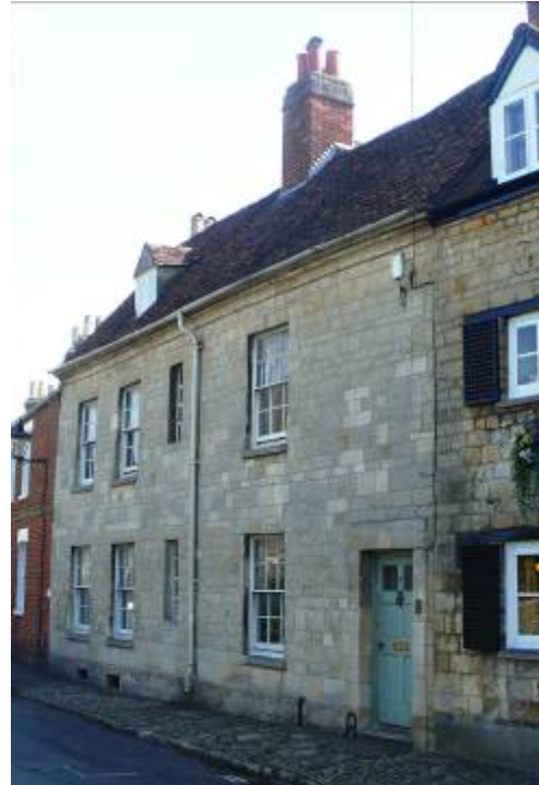
No. 10 St Andrew's Road

to provide symmetry and proportion in conformance with neo-classical ideals.