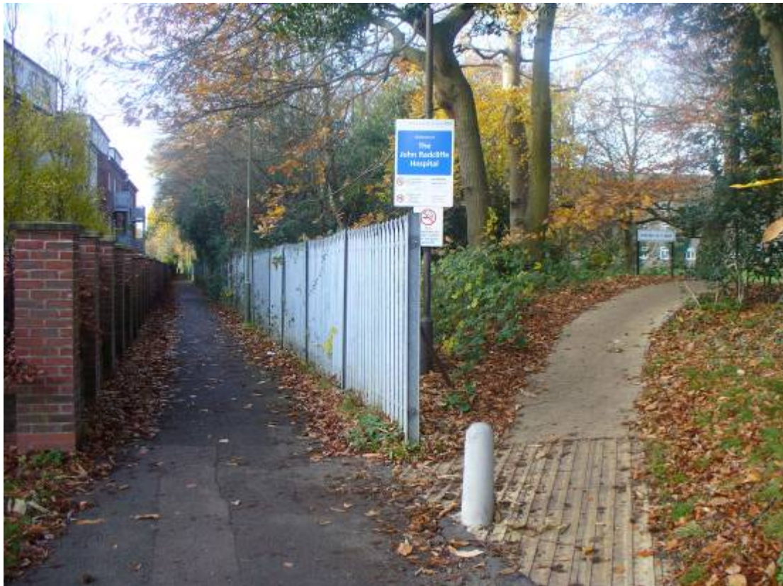
View west at Cuckoo Lane

Between Old High Street and Osler Road the course of the footpath was straightened in the 19 th century and excavated to run below the ground level of the gardens and parkland of Headington House. This would have allowed the owners of the house to view their estate, including the parkland south of Cuckoo Lane (which has now been developed over), without having to see passing travellers in their vista. The path's sunken course, which is now accentuated by overhanging trees and the fences of adjacent properties, provides visible evidence of the power of these wealthy landowners over the landscape surrounding them in the late 18 th and 19 th