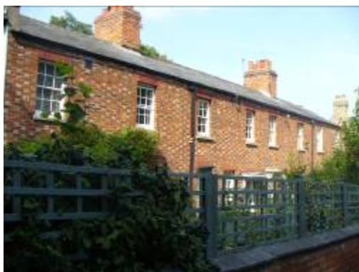
Nos. 2 – 5 The Croft

The 19 th century also introduced a cohort of brick-built houses, some of which contribute to the locally distinctive use of handmade Shotover bricks laid in Flemish bond with blue or 'dust-brick' headers forming a decorative chequer-work pattern. These include Nos. 16 The Croft, 35 St Andrew's Road and Nos. 2 – 5 The Croft, which have idiosyncratic features of design and fenestration that set them apart from mid and later 19 th century brick cottages built to more widely represented designs. Examples of the latter are seen in the village and reflect the encroachment of speculative development into the village in marginal areas such as The Croft, St Andrew's Lane and the western limit of St Andrew's Road and in larger groups on Old High Street.