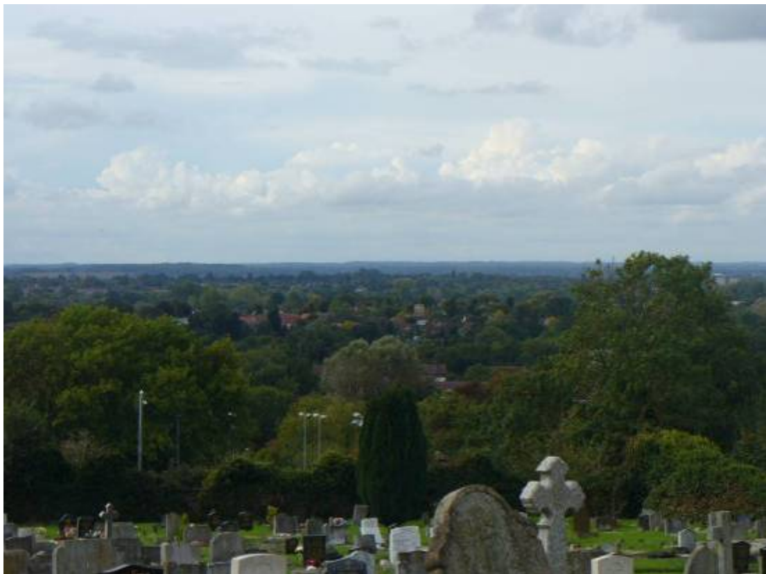
View north west from Headington Cemetery

The buildings are widely varied in their historic origins, materials and styles. They provide a cross section of the village's development history, including the 1960s experimental architecture of Nos. 10-18 Dunstan Road by Ahrends, Burton and Koralek, referred to by local people by various epithets including the Castle Houses or the Elephant Houses. Although partially hidden from the road by the front boundary wall, the roofline of these buildings is visible and provides a tantalising suggestion of what may lie