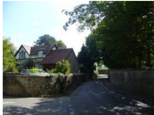
View west at Osler Road, including No. 6 The Croft