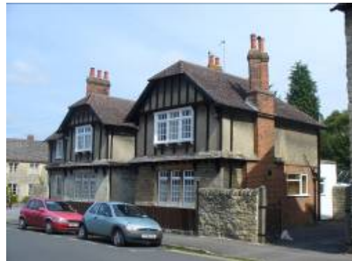
Linden Cottages, Old High Street

The new building was prominently located on Old High Street facing Linden Farm. A convent of Dominican Sisters bought Linden Farm in 1923, and renamed it as "The Priory of All Saints and All Souls", which was in turn purchased by The Congregation of The Sacred Heart in 1968 who simplified the name to The Priory. They used the building as a mixed religious institution and students' hostel. The local builder Charlie Morris replaced the three cottages just to the north of the Priory in 1909 with two semi-detached cottages in a heavy half-timbered Olde English style. Their new name 'Linden Cottages' is spelt out in initials carved in relief on the brackets that support the jettied first floor.