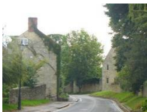
No. 8 Dunstan Road

Dunstan Road provides an important approach to the core area of the historic village from Northway and Marston but provides a contrasting character to the historic core. The area is focused along the long narrow space of the road. This has a pavement on the north side and a grass verge to the south, which is bounded by either a low, ivy-grown wall or a hedge that has grown into a mature tree line, both of which contribute to a pleasantly rural and occasionally sylvan character. Mature trees arch over the road from both sides creating a tunnel