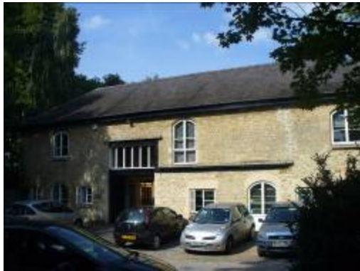
The former coach house at Bury Knowle, now used as offices

storeys, often with additional wings of a lower scale that were built to provide extra accommodation, as it was required. They are also distinguished from the farmhouses by the types of ancillary buildings with which they are associated. These include coach houses and stables, walled kitchen gardens, gate lodges and high boundary walls to their parks. These buildings are often just as ornate as the main house. The boundary walls have ornamental brick copings and monumental gate piers. The houses and their ancillary buildings stand well away from the roadside and are now often hidden from the road, although they may once have been more visible in designed vistas.