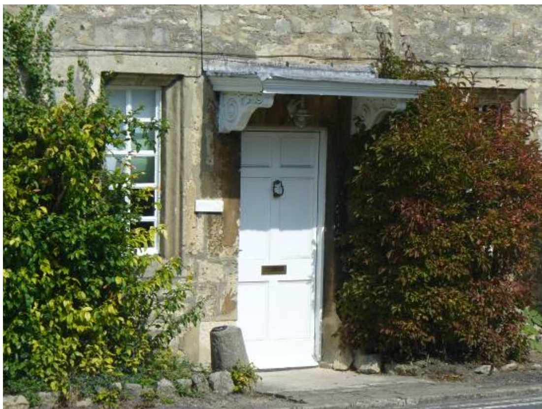
Front door of Mather's Farmhouse, Barton Lane

Within the conservation area numerous unlisted historic buildings make a positive contribution to its character and appearance. These buildings are illustrated on Map 3. However, where a building has not been marked this should not be taken to mean that it is of no interest but may reflect lack of access to land during the survey for this appraisal.