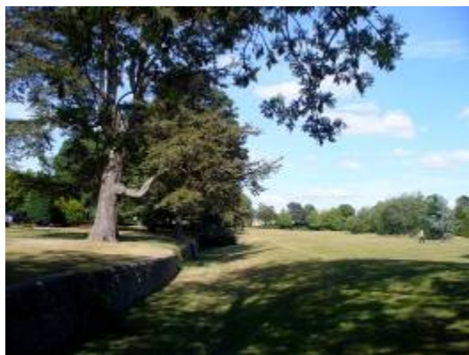
The ha-ha at Bury Knowle Park

Views across the parkland in the south and east are particularly attractive as a result of the combined elements of the wide, green open space, its historic settings, which includes including the park walls and surrounding buildings such as the village school and post-office on the south side of London Road), and the mature tree planting. Historically significant trees include specimen trees, planted to ornament the parkland, trees lining the boundary with London Road, which act as a screen to views from the street and an avenue running along the western edge of the park, which marks the former carriage drive to the house from gates on London Road. More recent tree planting in the park has included the small arboretum in the east, which replaced hockey pitches, as well as a second avenue running along the path following the eastern park boundary.