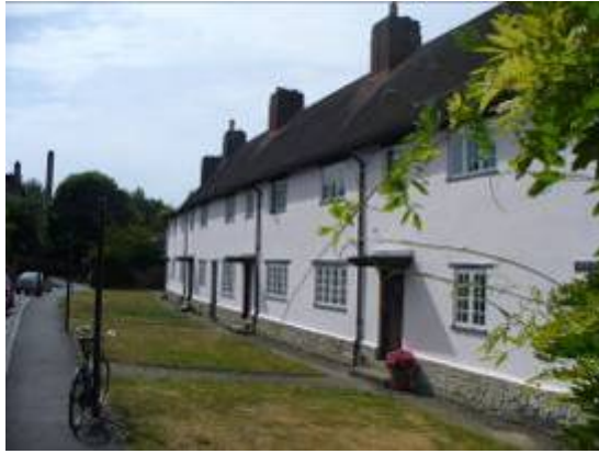
Fielding Dodd's houses at St Andrew's Road

The theme of building contemporary housing within the area continued into the 1970s with the construction of the buildings of Nos. 10 to 18 Dunstan Road in a highly contemporary style by the architects Ahrends, Burton and Koralek.