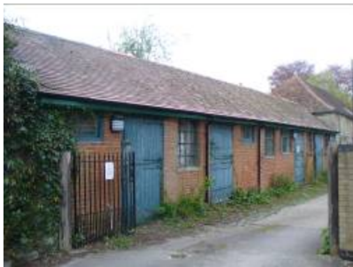
Late 19 th century stable building at Bury Knowle

Villa built in the first years of the 19 th century and represents a part of the move of wealthy Oxford merchants out of the city centre to the healthier climate of Headington Hill. It retains its associations with subsidiary structures, such as the coach house and stables, which were once required to support the high status lifestyle of its owners. The immediate surroundings of the house retain some of the polite landscaping of the 19 th century pleasure grounds that surrounded the villa, including exotic specimen trees, such as the large cedars to the front, as well as the ha-ha or sunken fence that allows views from the house to sweep across the lawns to the open parkland beyond.