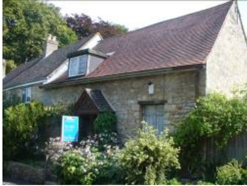
No. 18 St Andrew's Lane a small workers' cottage, probably of 18 th or early 19 th century construction

farms represented by the larger houses. A relatively high proportion of these buildings have been lost and replaced, including the ten on St Andrew's Road that were demolished in the 1930s. The remaining examples are to be all the more valued as survivors.