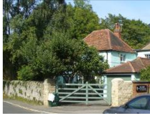
No. 1 The Croft

would have run around. This may suggest it was removed from the estate when it was subdivided. Alternatively it may have stood within the grounds of Headington Manor, at one corner of its kitchen gardens but was later cut off by a re-routing of Cuckoo Lane to the course of Osler Road.