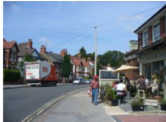
Old High Street view looking towards the conservation area

The conservation area lies at a transitional point between the suburban landscape of Headington and the rural hinterland beyond the ring road. To the north west, Dunstan Road runs steeply downhill to the Northway Housing Estate at Saxon Way. Headington Cemetery covers the ridge of the hill to the south of Dunstan Road and the vast complex of the John Radcliffe Hospital lies directly west of the conservation area. Here the surviving open parkland and buildings of Headington Manor inside the conservation area provide a contrast with the monolithic elevations of hospital buildings just outside its boundary. Osler Road continues south from the conservation area as a residential street of Edwardian or Inter-War houses, as well as including the green of the Headington Bowls Club and the site of the new Manor Hospital (formerly the home ground of Oxford United Football Club). Osler Road leads into the shopping area on London Road just to the south.