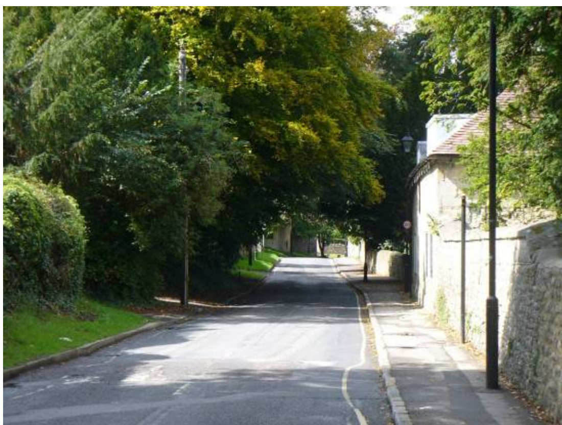
View west along Dunstan Road