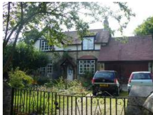
No. 6 The Croft

There is little or no differentiation between the surfaces for motor vehicles, pedestrians or cyclists, except where bollards restrict access to vehicles. The amenity and safety of this environment for pedestrians and cyclists is dependent on the maintenance of minimal traffic movement. It was pointed out during public consultation that this is still an area where children can play in the street. The numerous points of access, including routes through Laurel Farm, from Osler Road, St Andrew's Road and Old High Street, and the position on the routes to shopping areas on London Road or the public facilities at Bury Knowle, means that this area is popular with and very well used by pedestrians. The lack of traffic movement and noise also provides a distinct air of tranquillity, highlighted, on occasion, by the sound of the bell ringing at St Andrew's church (including the regular Tuesday night practice) or singing at the Baptist Church.