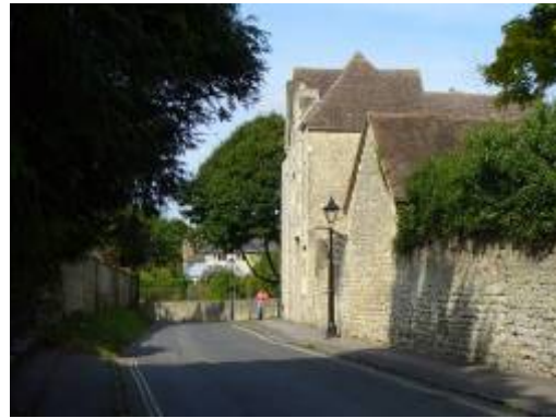
View north at Osler Road, including St Andrew's House

channel views along the road. None of these buildings address the street directly, with entrances on other streets or through gardens. They are well spaced in large plots and rise up to three stories at the Old Pound House and St Andrew's House. However, they are of a more domestic scale than the mansions to the south. The break in the line of vision along Osler Road, increased enclosure of the road and change in scale and spacing of the buildings provides a comfortable transition in character between the larger properties and formal landscapes to the south and the densely built-up village core to the north.