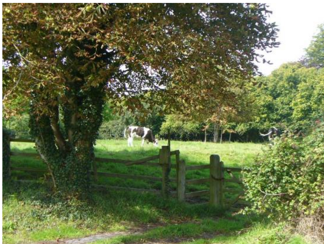
Oxford Preservation Trust's fields at Barton Lane