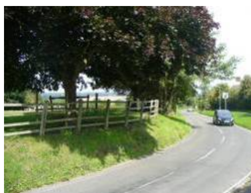
Views East at Barton Lane

This area includes the remnants of the agricultural land on the edges of the historic village, which have been separated from the surrounding landscape