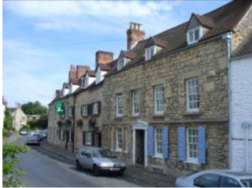
View along the St Andrew's Road frontage

attractive group of cottages at Nos. 8 – 11a The Croft, is of particular note and must be truly picturesque in high summer, when the small cottage gardens are full of flowers.