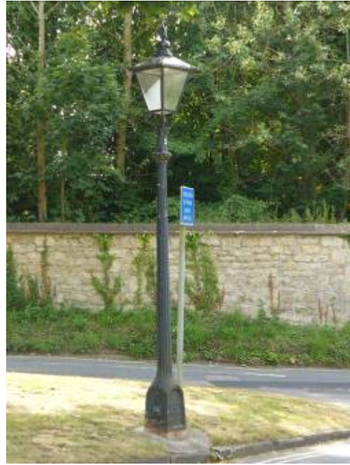
A 'Lucy and Dean' lamppost

The parkland areas have specific furniture, which reflects their use as a recreational and community resource. These are described in more detail in the character area descriptions below.