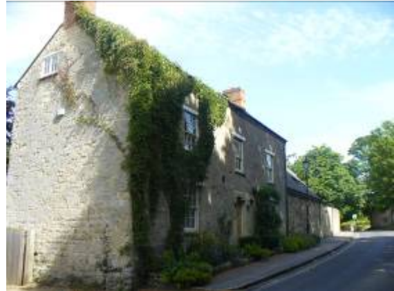
Lower Farm (No. 8 Dunstan Road), built around 1800 is a late addition to the group of vernacular farmhouses and cottages

and the booming university town as from agriculture.