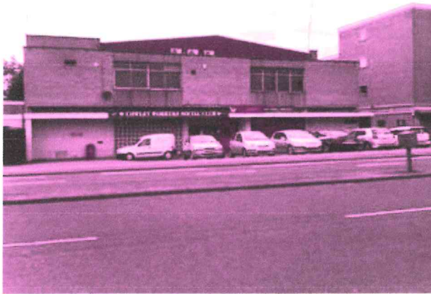
Image of Cowley Workers Sports & Social Club, looking on from Saint Lukes Road.

Nomination: Asset of Community Value (Localism Act 2011) Nominees: The Management Committee and Members of the Cowley Workers Sports & Social Club – Reg Charity NO. FSA (FCA) N1087W Register continuous since 1929. Non Political Institute & Union Club. Registered/Accepted by Oxford City Council as a Mutual Charity non-profit making Club, for reasons of rent valuation. Founded 1927 in Cowley, Oxford. Existing Membership numbers at 1 st of August 2020 520