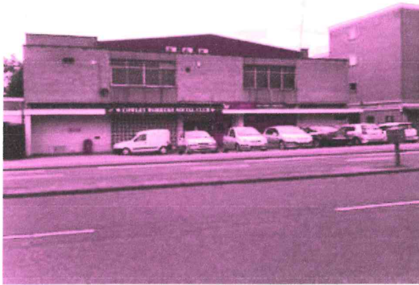
Image of Cowley Workers Sports & Social Club, looking on from Saint Lukes Road.

Nomination: Asset of Community Value (Localism Act 2011) Nominees: The Management Committee and Members of the Cowley Workers Sports & Social Club – Reg Charity NO. FSA (FCA) N1087W Register continuous since 1929. Non Political Institute & Union Club. Registered/Accepted by Oxford City Council as a Mutual Charity non-profit making Club, for reasons of rent valuation. Founded 1927 in Cowley, Oxford. Existing Membership numbers at 1 st of August 2020 520