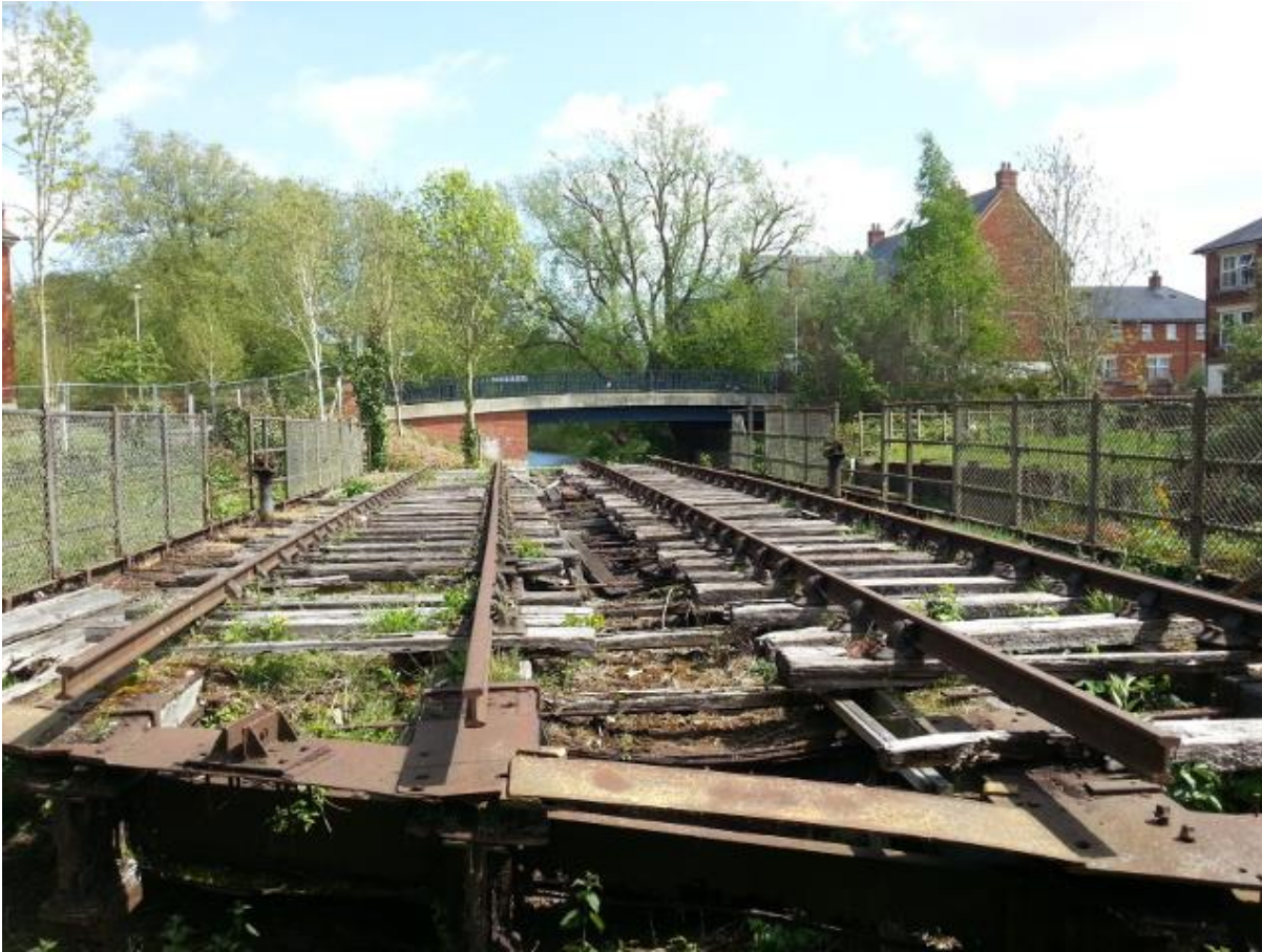
Swing Bridge Heritage Asset – Looking east along Rewley Abbey Stream to the Canal