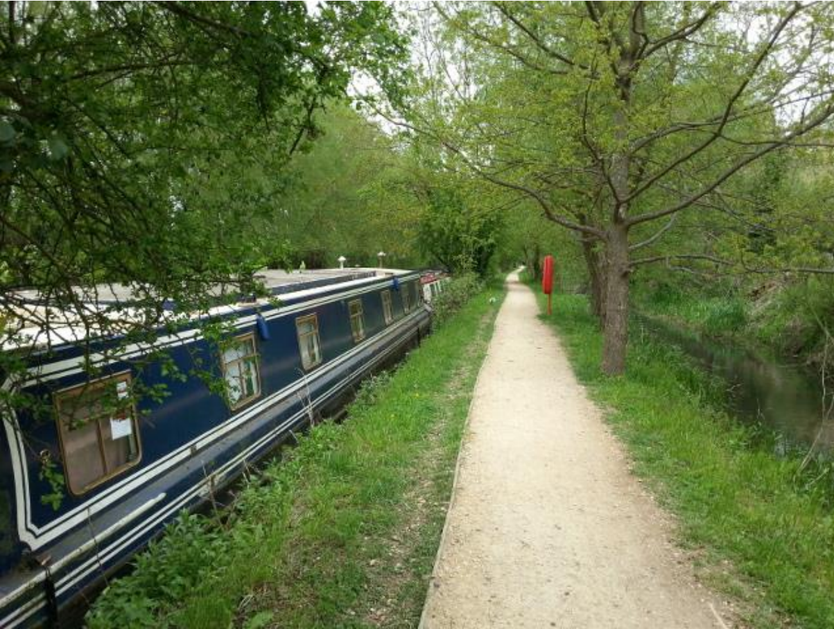
Approaching Port Meadow looking north