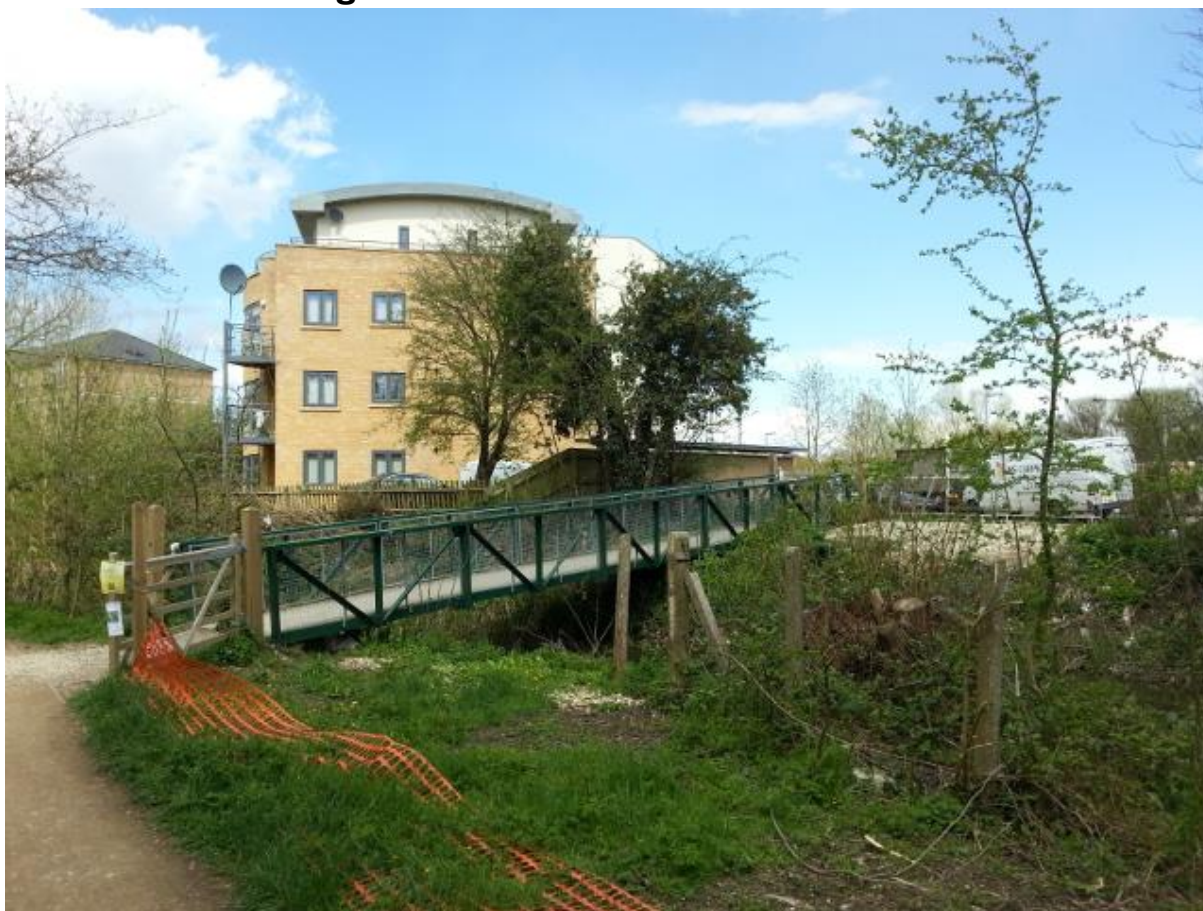
Current Development – Screening still possible – note satellite dish