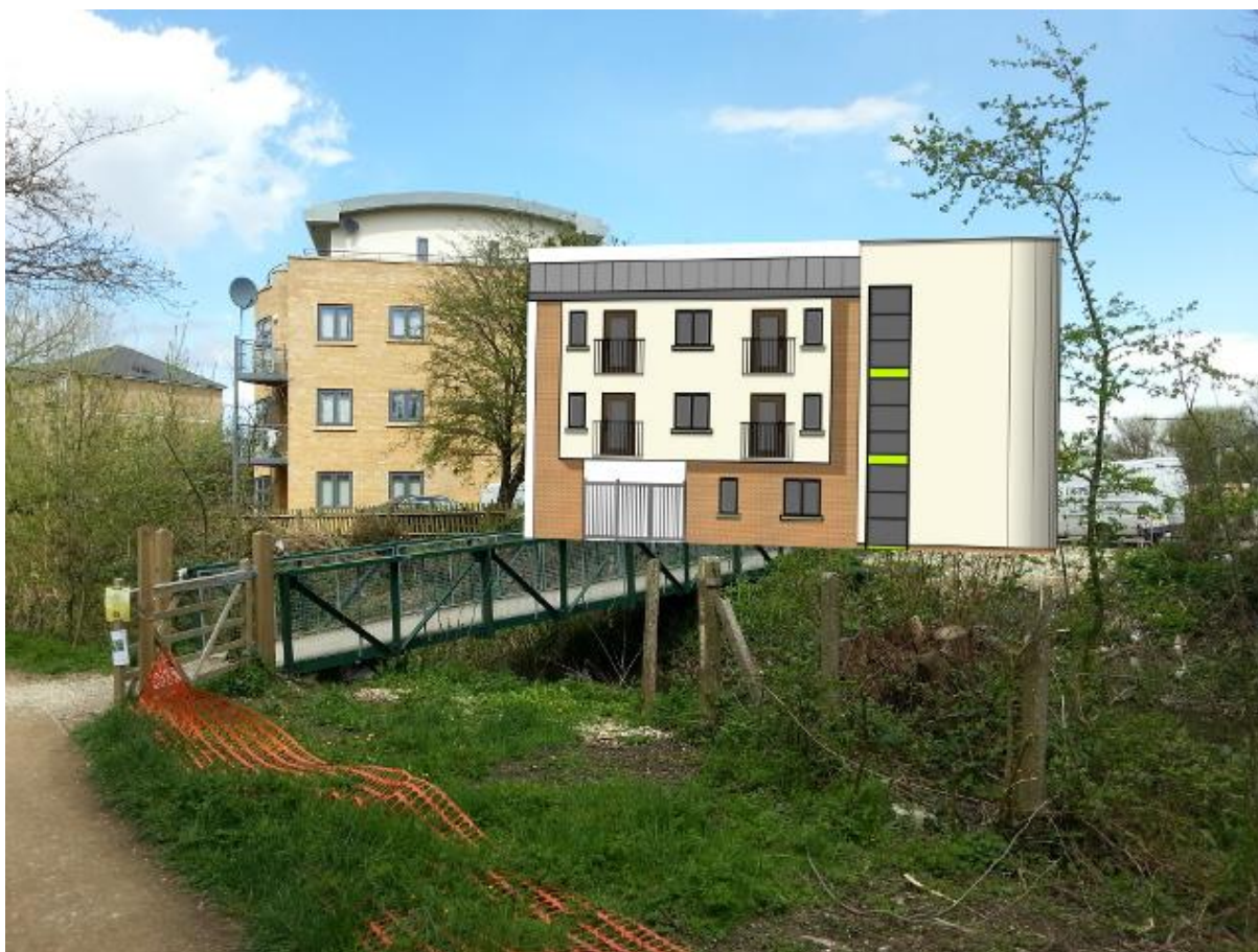
Unmeasured attempt to visualize new development based on submitted plans