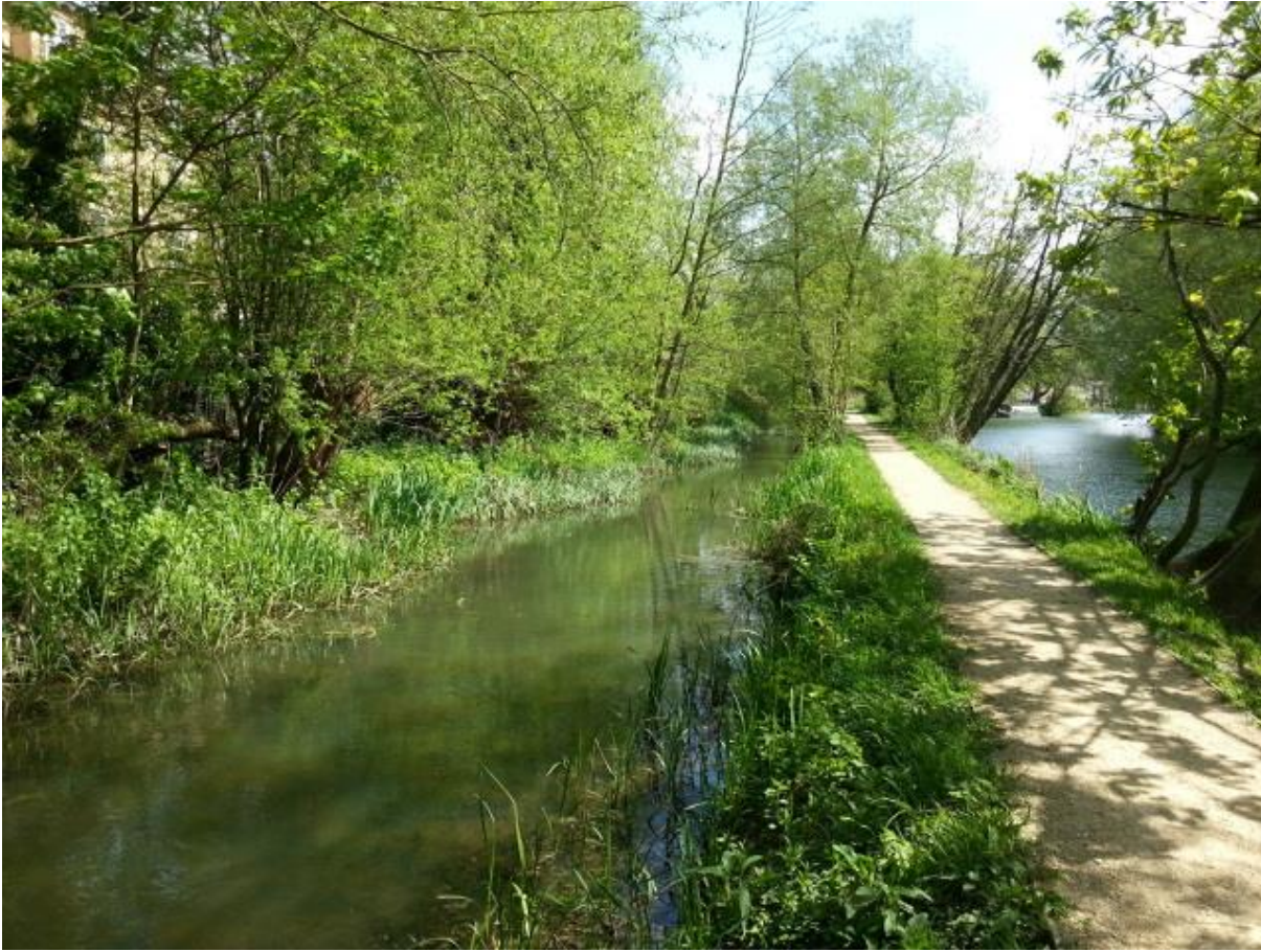
Fiddler's Stream 20m north of development site looking south