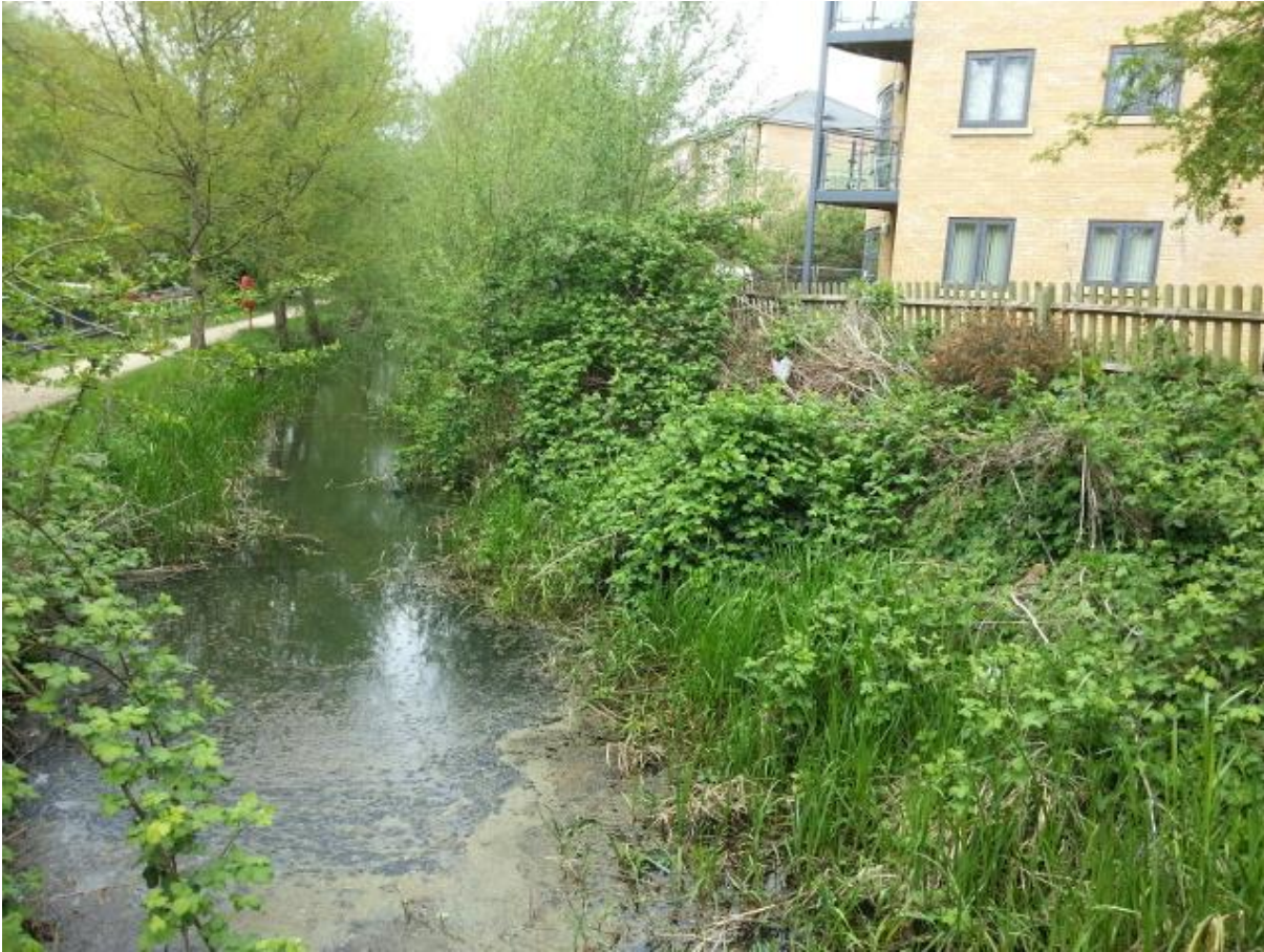
Fiddler's Stream at development site looking north

Fiddler's Island Streams, as distinct from the Thames, provide a very narrow band of habitat on the east side, connecting Port Meadow to areas downstream.