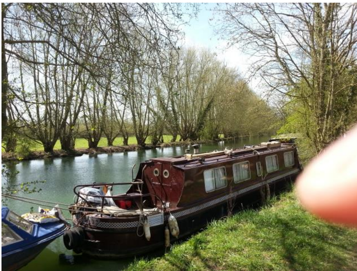
One of many traditional style boats moored here and in Rewley Abbey Stream

The presence of narrow boats moored along the banks of the Thames and Fiddler's Island is an important reminder of an 18 th century heritage.