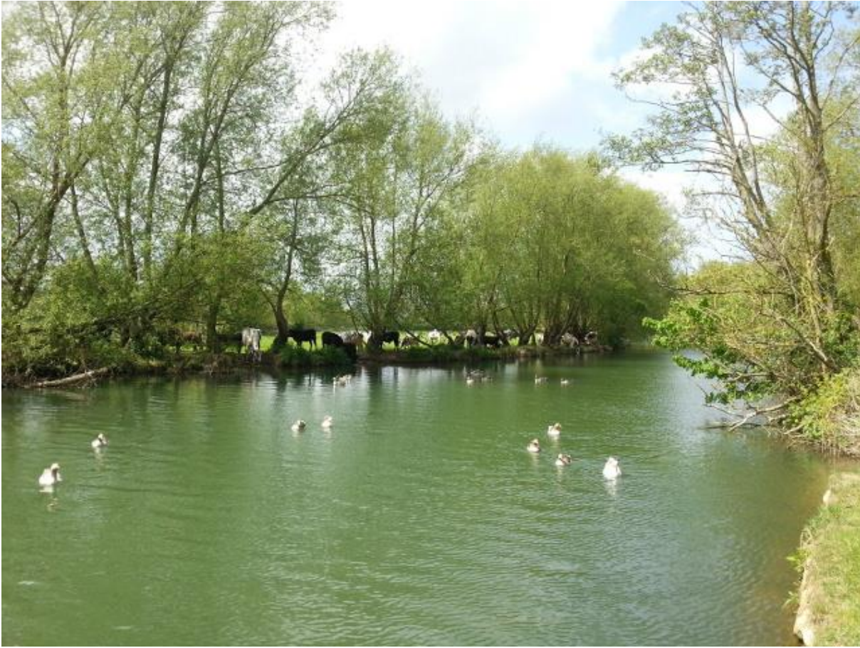
Cows grazing at River Thames at development site looking north-east