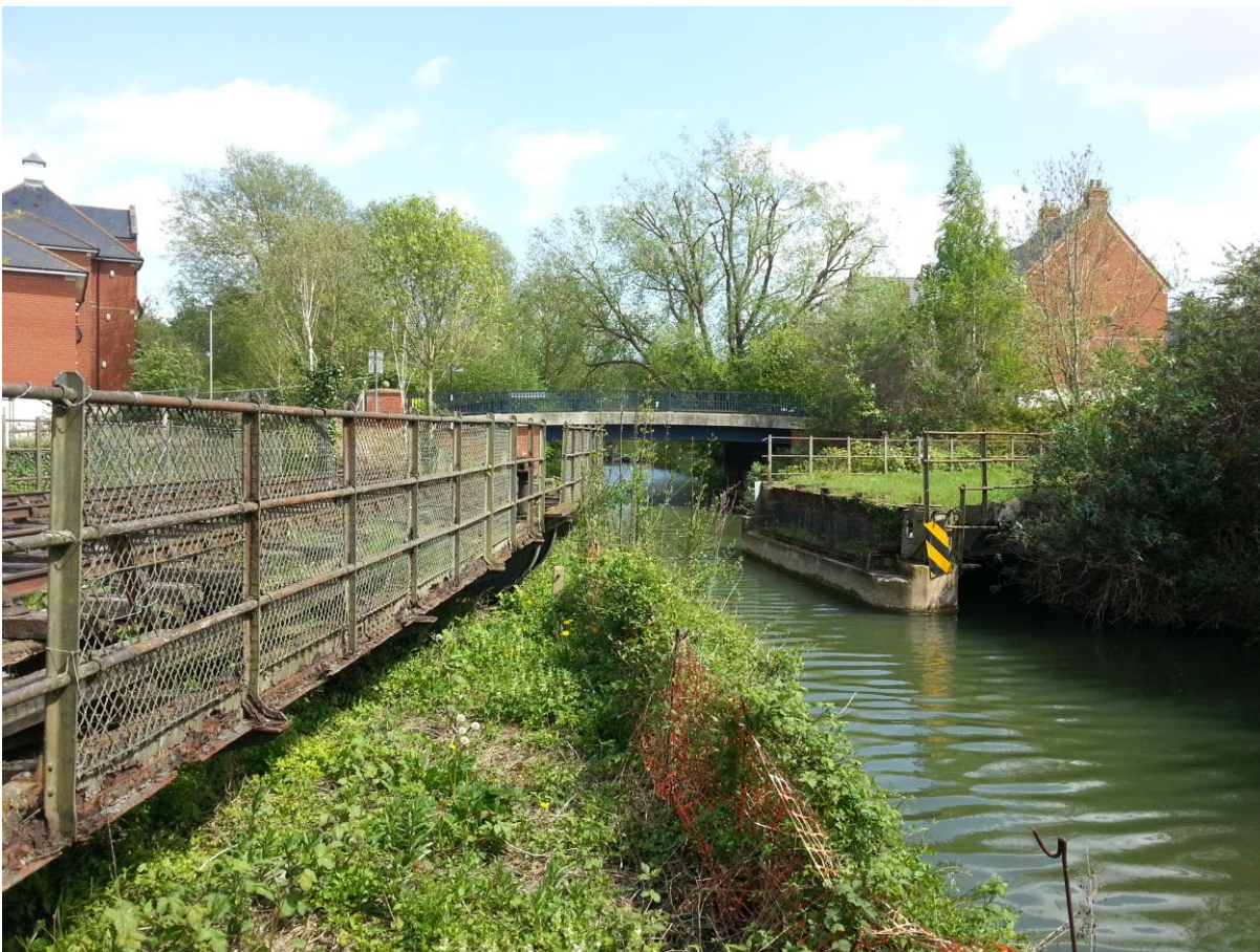
Rewley Abbey Stream at Swing Bridge Heritage Asset looking east to canal