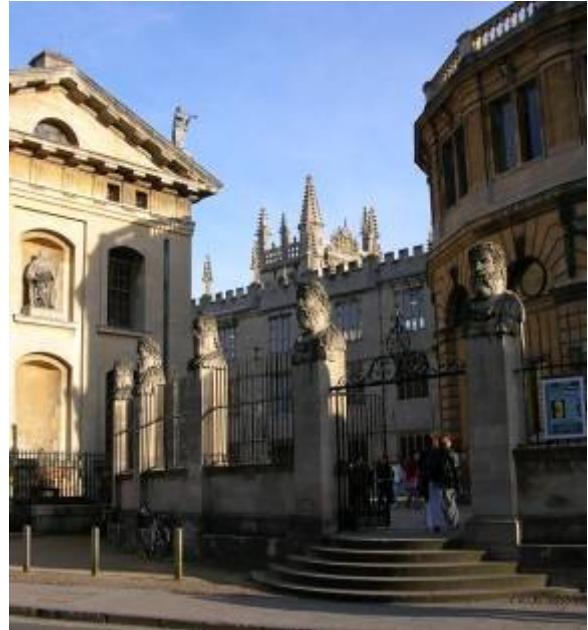
The familiar image of Oxford's nationally significant heritage assets.

The City Council has a number of existing planning policies that identify and manage locally valued and significant features of the historic environment within planning and the Council's other decision-making. These locally designated heritage assets include view cones and a high buildings control zone, protected by Policy HE.10 of the adopted Local Plan. The Local Plan also includes policies for the management of Buildings of Local Interest (Policy HE.6) and Important Parks and Gardens (HE.8). However, the Council has not previously adopted an official list or register of these assets.