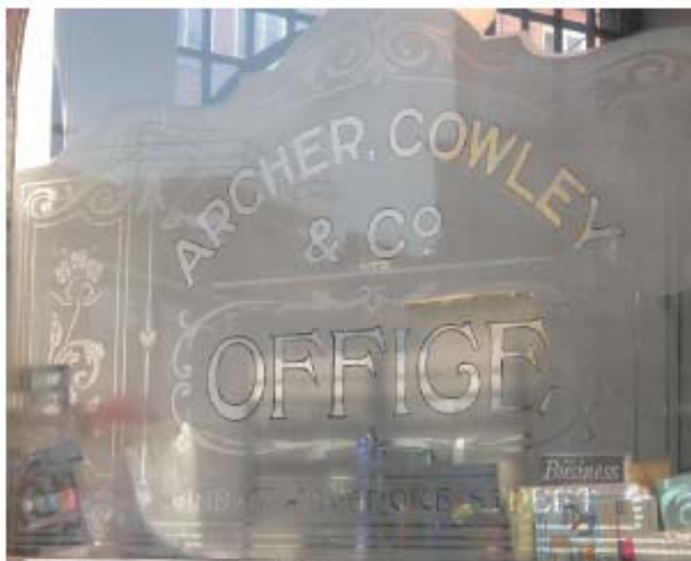
Detail of the Cantay Depository, Park End Street

Initially the heritage assets register will cover four trial areas of the city (shown on the proposed study map, including East Oxford (St Clement's, St Mary's and Iffley Fields Wards) Summertown district centre and environs, West Oxford (including parts of Carfax and Jericho and Osney Wards) and Blackbird Leys (Please see the map showing the locations of the four study areas). The Council hope to have prepared a list of candidate heritage assets for East Oxford as a pilot study by late Spring 2012. At a later stage it is hoped that this register can be expanded to cover other areas of the city.