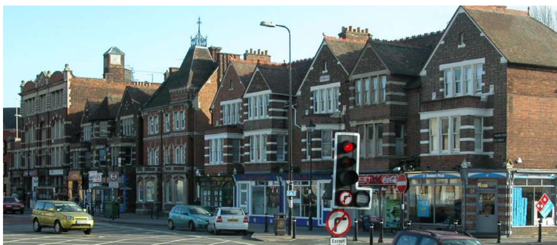
Buildings forming the south side of Frideswide's Square