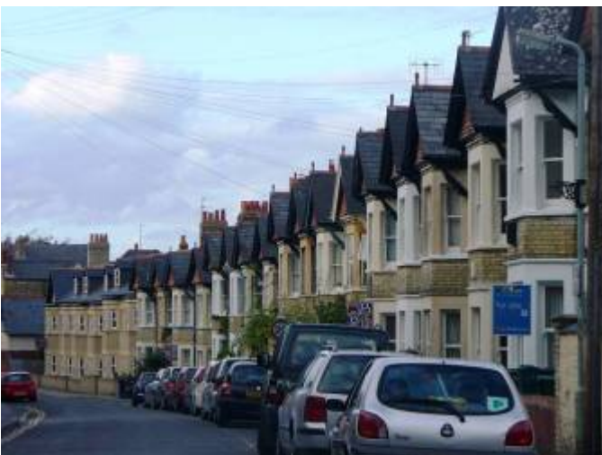
Oxford contains areas and buildings that might not meet the national criteria for statutory designations but are still valued locally for their historic interest.

This description suggests a wide range of landscape or townscape elements might qualify as heritage assets. They include the nationally and locally designated heritage assets of Scheduled Monuments (archaeological sites), Listed Buildings, Registered Parks and Gardens and Registered Battlefields, which are protected by law and are selected by English Heritage according to criteria that ensure they are of national significance. Conservation Areas are designated as heritage assets by the City Council but are also protected by law and selected according to nationally determined criteria.