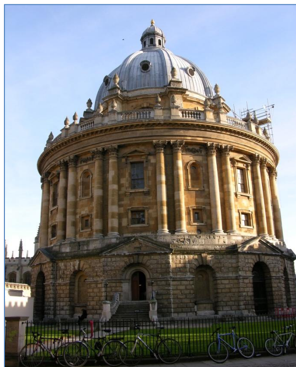
The Radcliffe Camera, a Grade I listed building is one of Oxford's most iconic buildings

Listing protects both the inside and outside of a building, as well as fixtures and fittings (like windows, doors or staircases) and subsidiary buildings that form the 'curtilage' of the building. You can only make alterations to a listed building if the local planning authority (the City Council) grants Listed Building Consent for any changes that might affect the historic or architectural interest of the building. Their decision will be based on