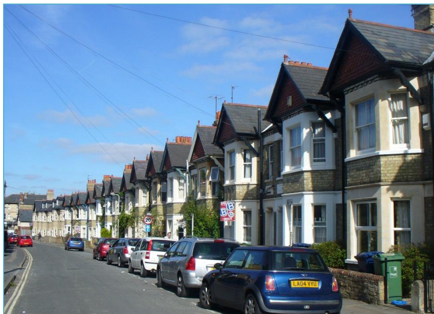
The regularity of materials and detailing in this street frontage in East Oxford makes a positive contribution to the street's historic character

Oxford's historic environment is rich and diverse, not only in terms of adding economic value through tourism but adding to the quality, health and wellbeing of people's lives. Oxford City Council are concerned to protect the positive qualities of the city's environment, including the architectural interest and quality of historic buildings across the city, not just within protected areas, or where these have been identified as of national significance.