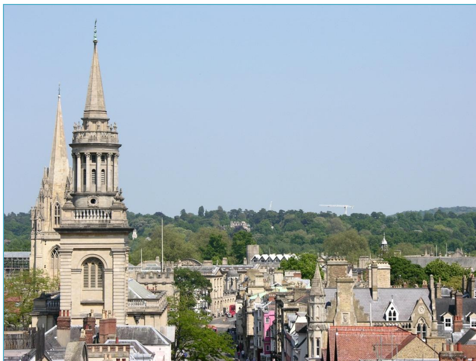
Part of the Oxford City Centre's roofscape seen from Carfax Tower

More information about the Oxford Views can be found on the City Council's website at: http://www.oxford.gov.uk/PageRender/decP/OxfordViewsStudy.htm