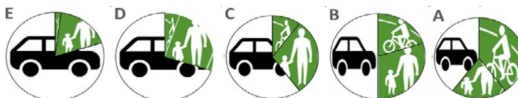
Figure 1. Typical modal share of local trips (people trips rather than vehicle trips)

On the basis of the measures adopted in the CAT scale, different travel outcomes and mode shares can typically be expected in terms of urban travel as set out in the diagram below. Note bus use is included in the walking share.