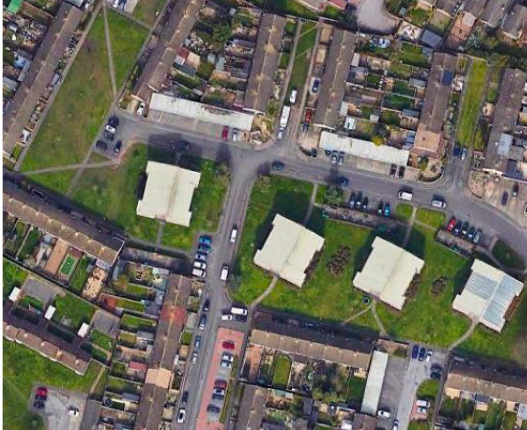
Figure 3.8: Field Avenue OX4 6PH