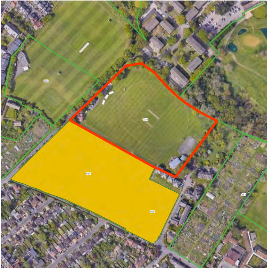
Figure 3.13: Jesus College Playing Field – North (Site 234)