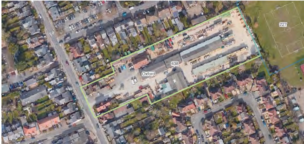
Figure 3.2: Blanchfords Builders Yard (Site 438)

Source: QGIS using data from Google earth and Oxford City Council