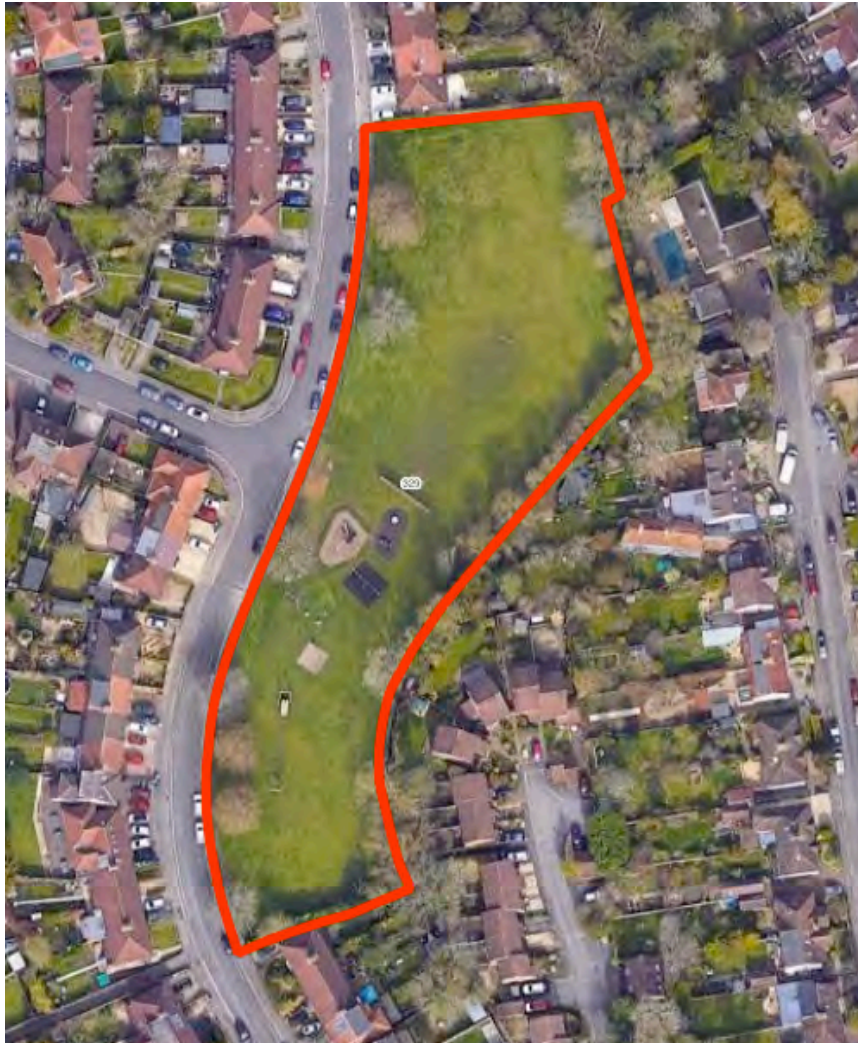
Figure 3.11: Valentia Road (Site 329)