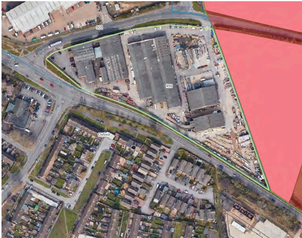
Figure 3.3: Buildbase, Watlington Road (Site 459, within Site 503)