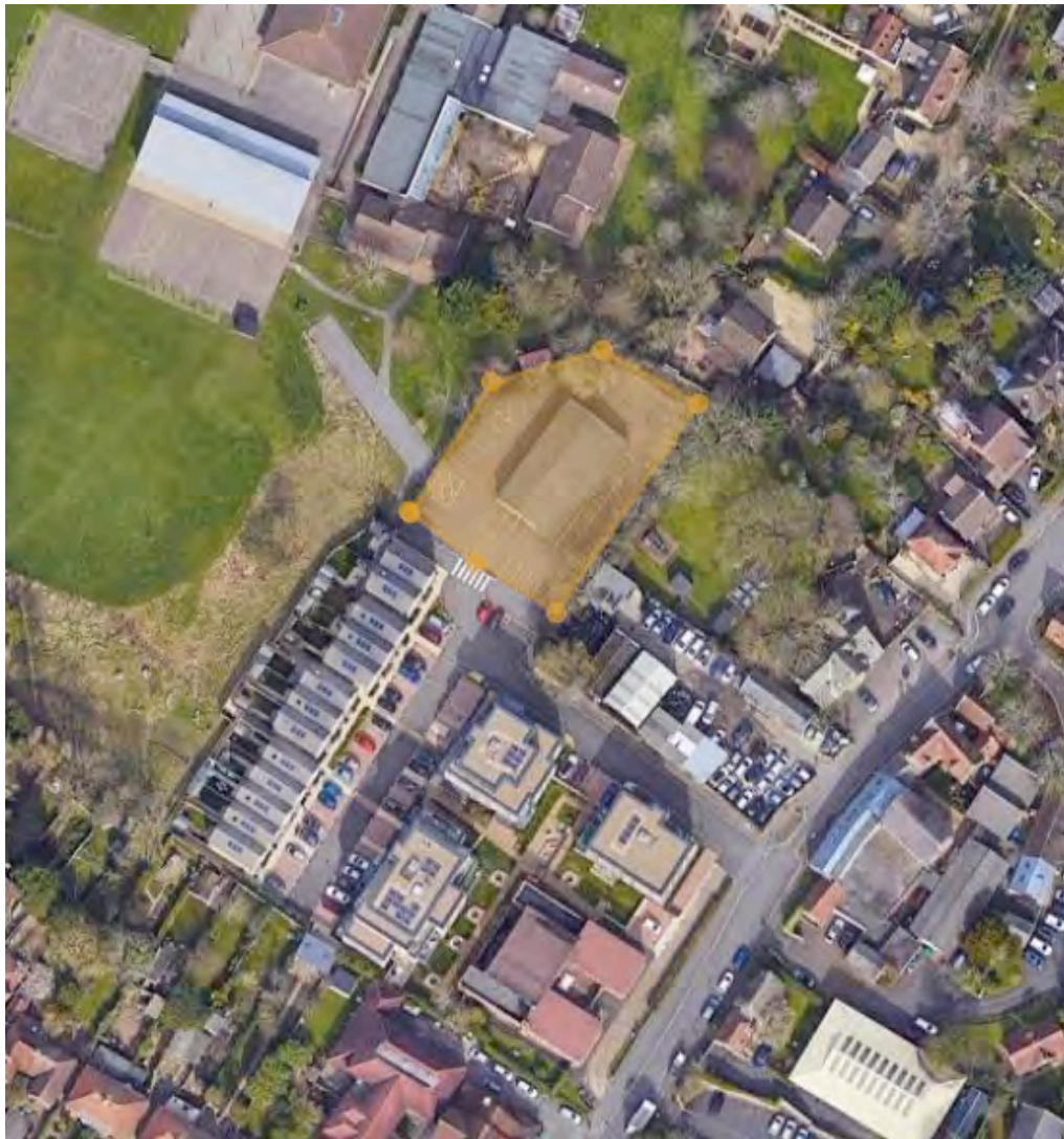
Figure 3.10: Band Hut Adjacent to HELAA Site 058