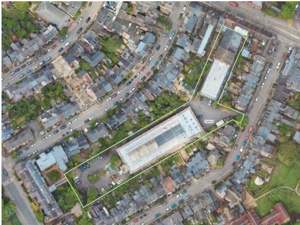
Figure 3.4: Former Blackwells Publishing, Marston Street (Site 492)