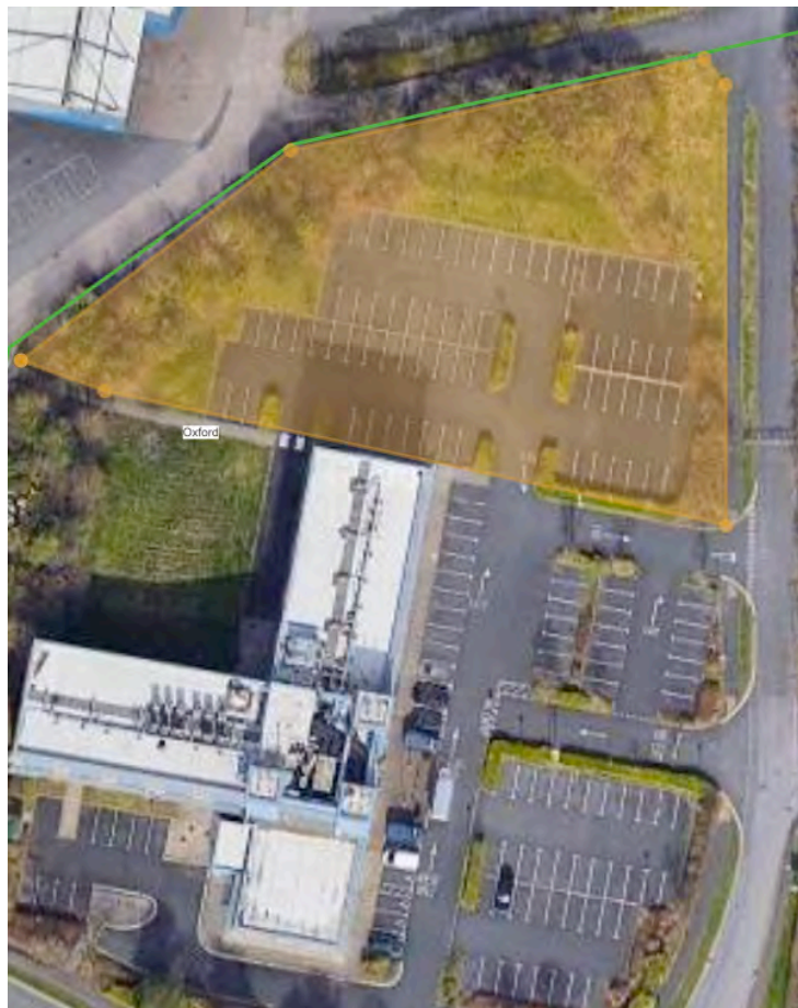
Figure 3.9: Land Adjacent to Allocation SPS2 (Kassam Stadium) and part Car Park of Holiday Inn Express