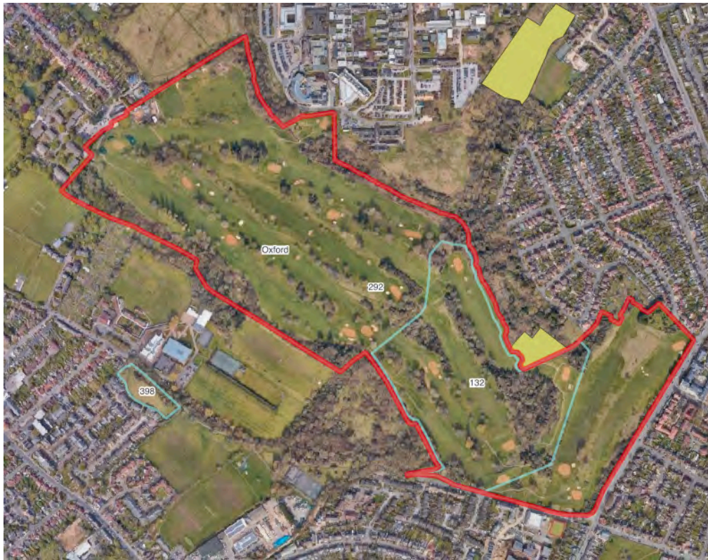
Figure 3.5: Southfield Golf Course (Sites 132 and 292)

Source: QGIS using data from Google earth and Oxford City Council