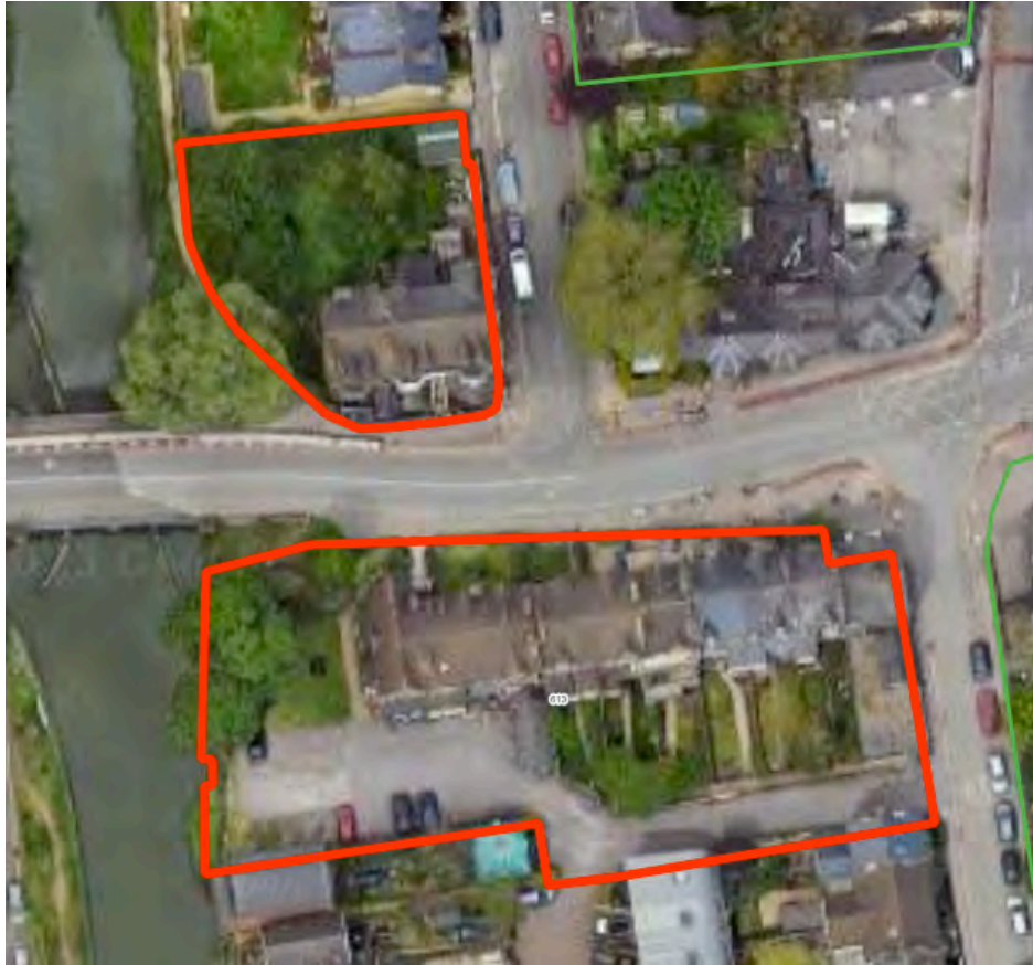
Figure 3.12: Sites Adjacent to the East of Osney Bridge, to the North and South of Botley Road (Site 613)