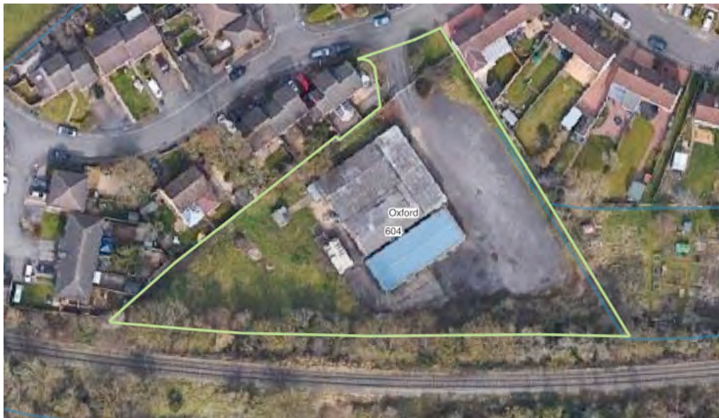
Figure 3.1: The Royal British Legion, Lakefield Road (Site 604)