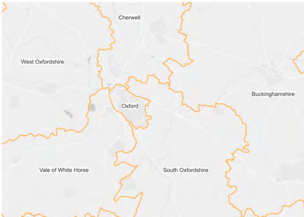
Figure 1.1: Oxford City, Broad Location