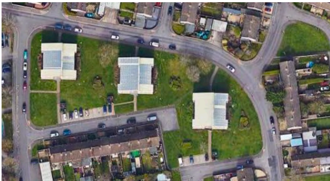
Figure 3.7: Sorrel Road OX4 6SL