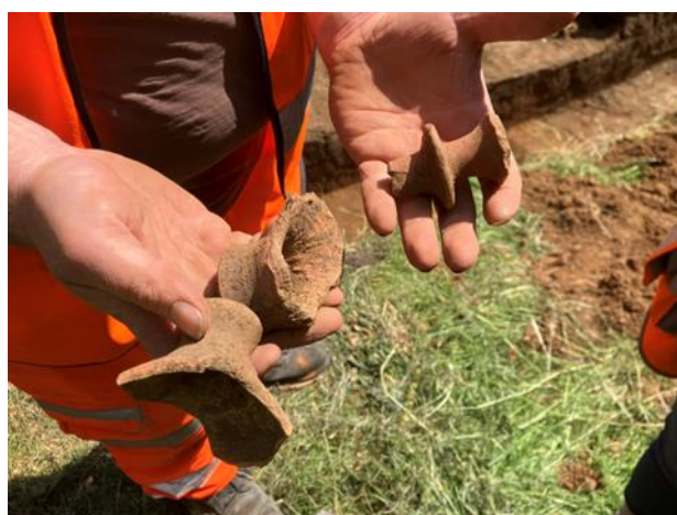
Right: Roman pottery from the Northfield Hostel site.

In June further evaluation was undertaken by Cotswold Archaeology on the western part of the Northfield Hostel development site. A single sizable Roman ditch with associated pottery and fragments of daub was recorded. Further work is planned.