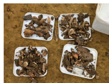
Above left: One of the sunken featured buildings being excavated in quadrants. Above right top: Roman and Saxon pottery from the feature. Above bottom right: A large assemblage of animal bone from the feature.