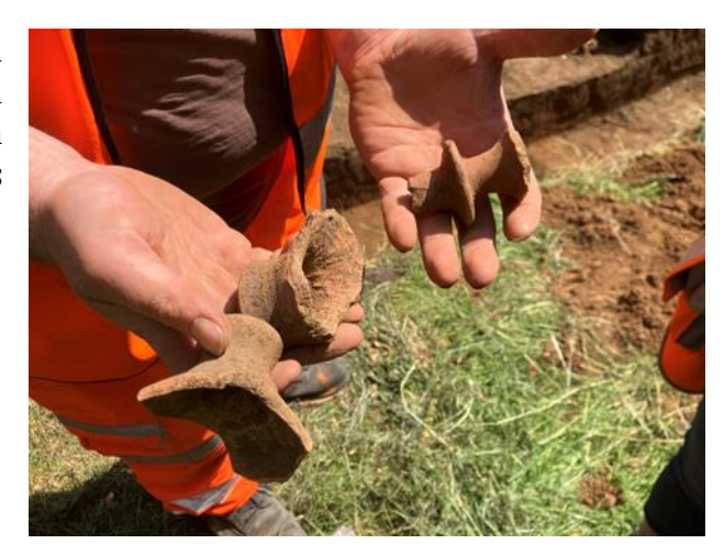
Right: Roman pottery from the Northfield Hostel site.

In June further evaluation was undertaken by Cotswold Archaeology on the western part of the Northfield Hostel development site. A single sizable Roman ditch with associated pottery and fragments of daub was recorded. Further work is planned.