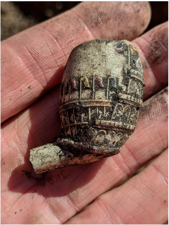
Above left: A Prattware pot lid with old woman playing cribbage. Above right: a Great Exhibition 1851 painted clay tobacco pipe.