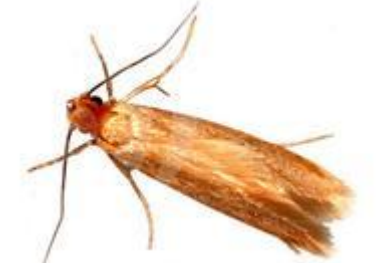
Common Clothes Moth