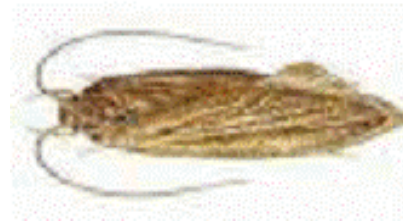
Brown House Moth