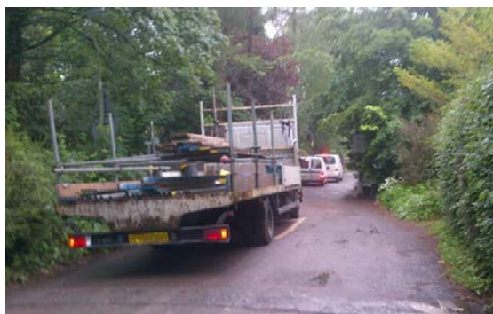
Traffic has been heavy on Pullens Lane at particular times of day in recent years

The lanes in this part of the conservation area are now heavily used by pedestrians and cyclists with a rising number of motorists, using them as a route to and from the many institutions and halls of residence within and around the conservation area. Use by cyclists and pedestrians is considered to be an acceptable and even positive characteristic of the area, as it reflects the hill's historic use for quiet exercise and recreation and contributes to the tranquil character whilst allowing many people to benefit from its attractive rural character. However, the increase in student numbers in recent years, has seen a rapid increase in the use of Pullens Lane by large groups