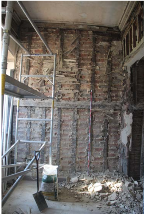
The exposed north side of the partition between the Lodge and the two small bedrooms in Tom 6.1G

In March building recording and a watching brief was undertaken by the Graham Keevill Consultancy during building works within the 16 th century Porter's Lodge at Christ Church. The north side of the partition between the Lodge and the two small bedrooms in Tom 6.1G was exposed (photo below). Dan Miles undertook dendrochronology sampling from three of the posts (one in the southern partition), the ground beam and the secondary beam. The report is forthcoming.