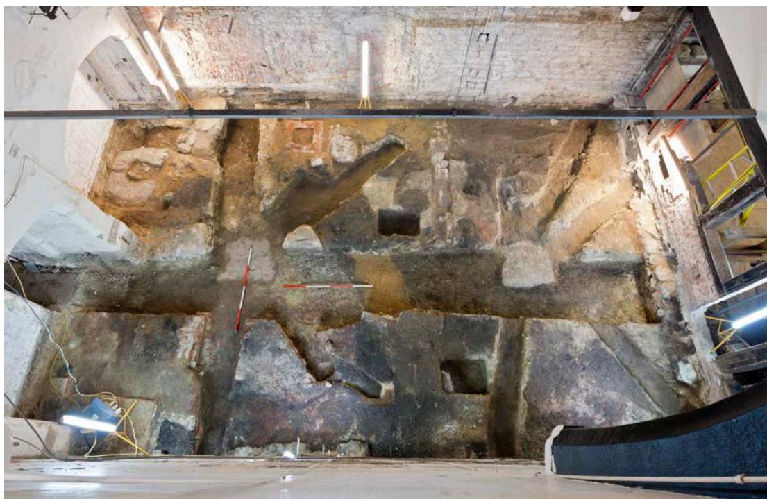
The floor of the 14 th century kitchen after the completion of recording work

The works have allowed investigation of Hugh Herland's primary roof, with wall plates and rafter feet recorded along with an intact arch-braced principal truss previously hidden behind the nineteenth-century east wall of the kitchen. In the buttery, surviving fourteenth-century floorboards were noted below layers of more recent flooring. A programme of dendrochronological sampling coordinated with Dr Dan Miles has provided felling dates of winter 1382/3 for the timbers of the buttery roof, floor and east wall. Floor joists, reused in later repairs to the buttery roof, very probably derive from the hall floor, which was replaced in 1722; these timbers were felled in the winter of 1387/8. The hall door was also shown to be late fourteenth century in date.