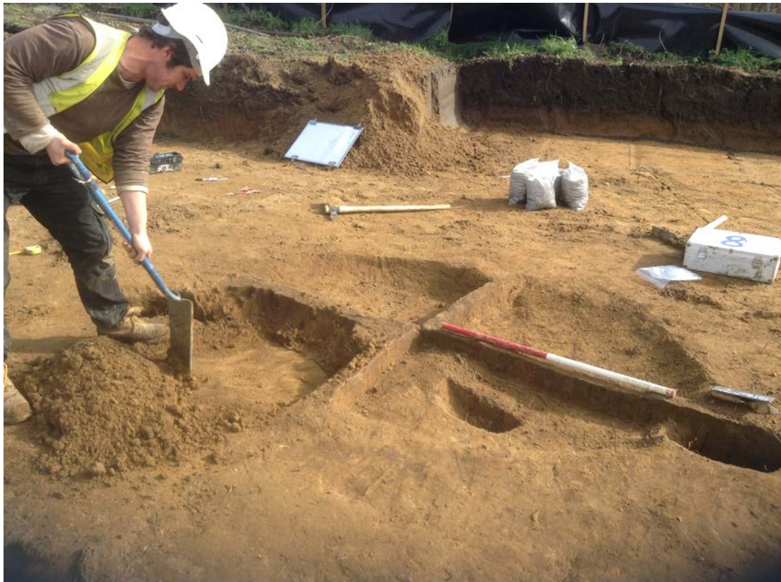
A small early Saxon sunken featured building at East Minchery Farm Allotments

Between February and March Thames Valley Archaeological Services undertook trial trenching and a strip and record excavation at the former site of the East Minchery Farm Allotments. A single small early-Saxon Sunken Featured Building was identified. The report is forthcoming.