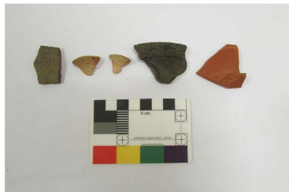
Trenching at Oxford Road recovering Roman pottery sherds and a quernstone fragment.