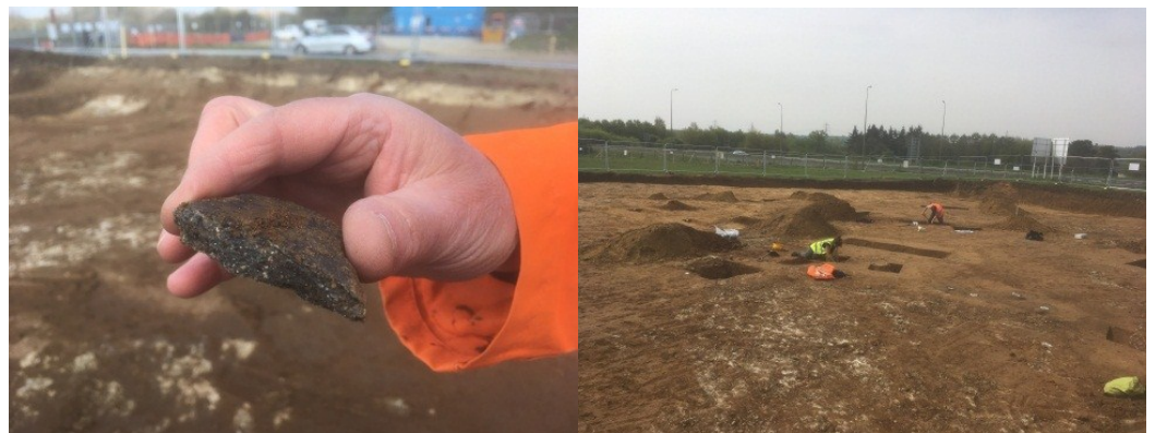
Above left: The intersection of Iron Age field boundaries that were investigated. Centre: A sherd of Iron Age pottery. Right: TVAS at work sampling the Iron Age ditches.