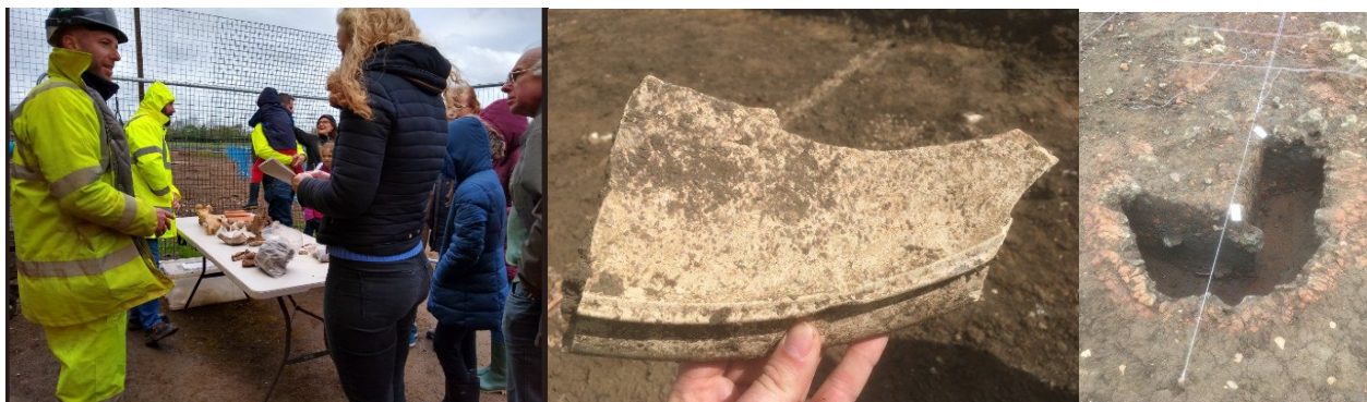
Above left: The archaeological open day at the Swan School site. Centre: A sherd of Roman mortaria from the kiln. Right initial sample slots through the kiln firing chamber.