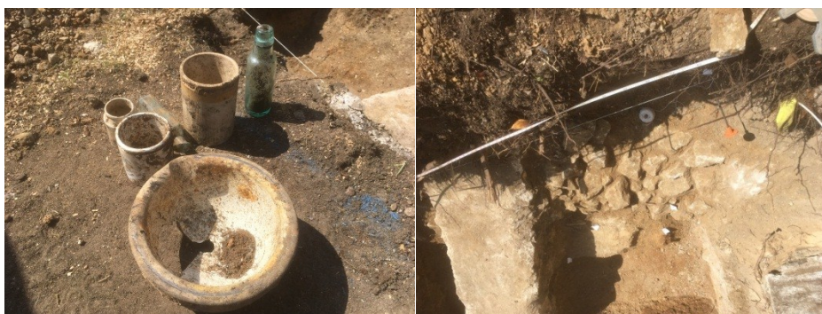
Above right: Victorian pottery and glassware recovered from the large quarry pits near the Martin Building. Right: Large stone foundation belonging to the Merton College's large tithe barn located in the suburb of Holywell.

In May a second phase of trial trenching was commenced by Oxford Archaeology on the site of the Balliol College Master's Field Development in the vicinity of the Martin building. The work was designed to test for the survival of Merton College's sizable medieval tithe barn complex which is known to have survived here into the 19 th century. The trenching revealed the walls of the barn, however as anticipated the bulk of the barn footprint was extensively truncated by post medieval and Victorian quarry pits. The work is ongoing.