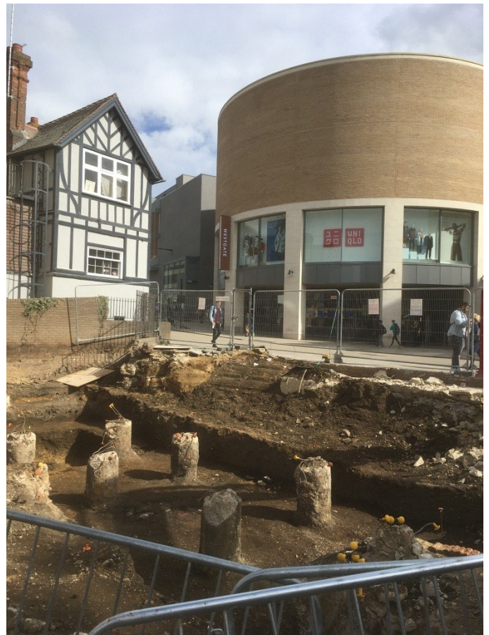
Above left: Hearths of likely medieval date at Paradise Square. Right: looking across the site towards the Westgate Centre.