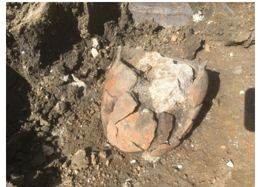
Right: Possible Roman cremation burial at the Swan School site.

A short video diary about the Swan School dig can be viewed on Twitter and Facebook (you may need to cut and past the link):