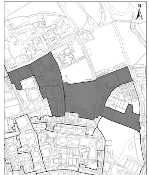
■ The modern colleges and the edge of the Science Area (Zone H)

© Crown Copyright and database right 2011. Ordnance Survey 100019348.